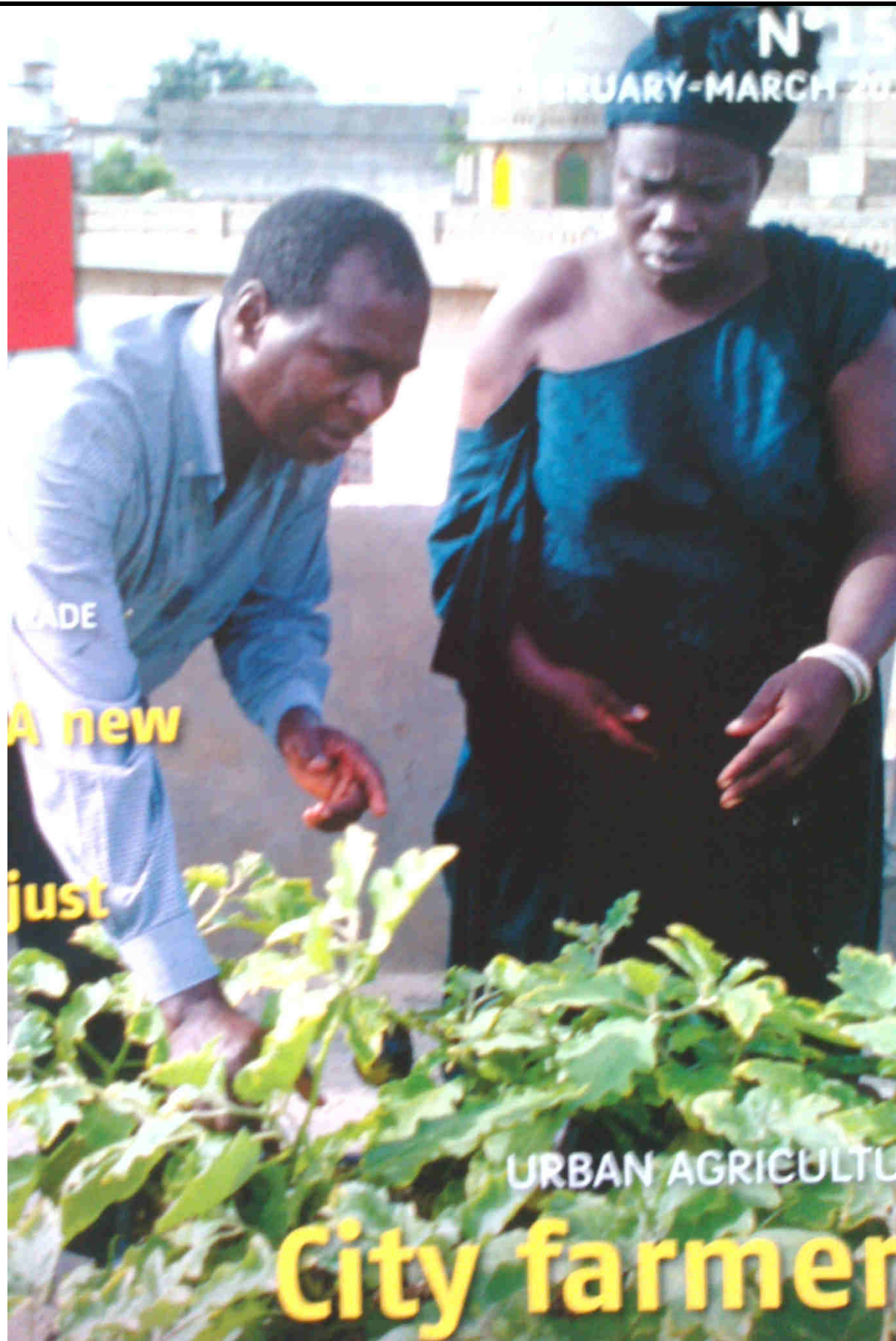
Plate 5: Urban Agriculture in Mali.