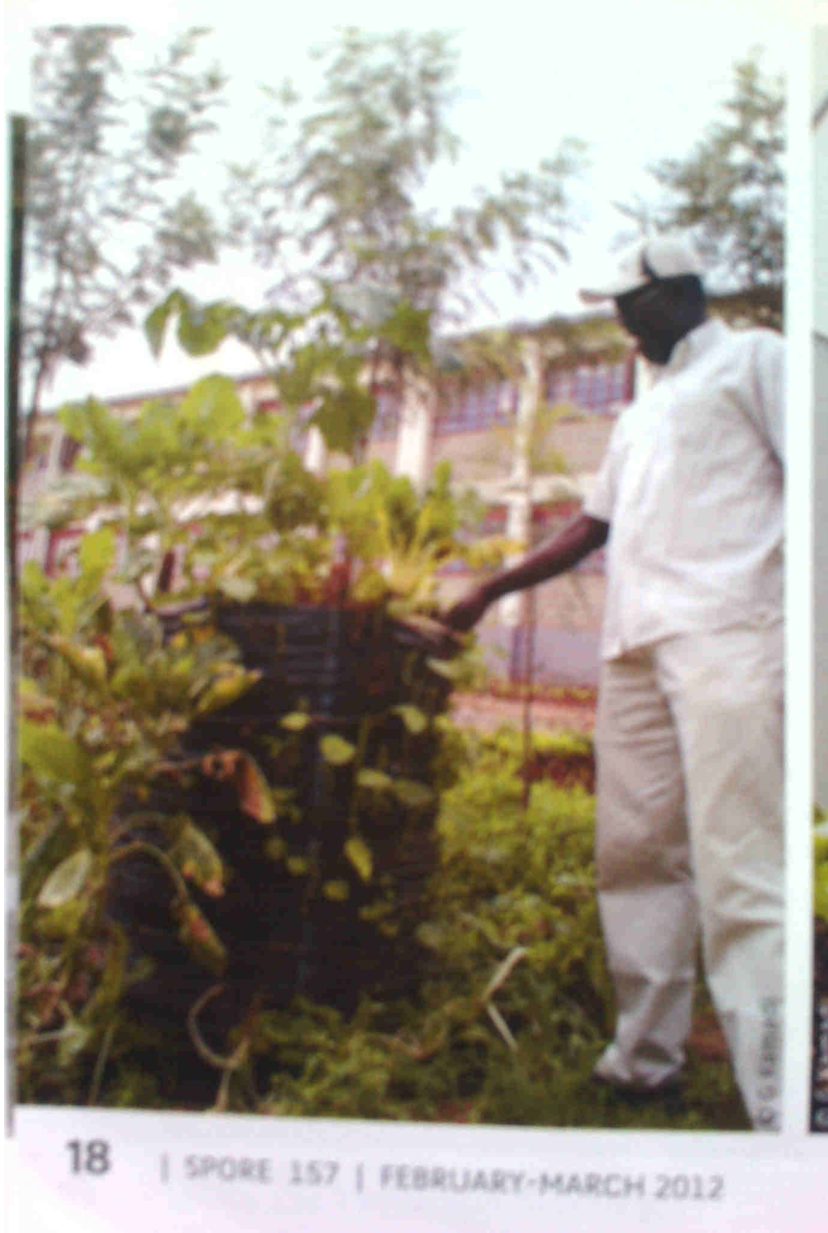
Plate 3: Sack gardening in a Kenyan suburb.