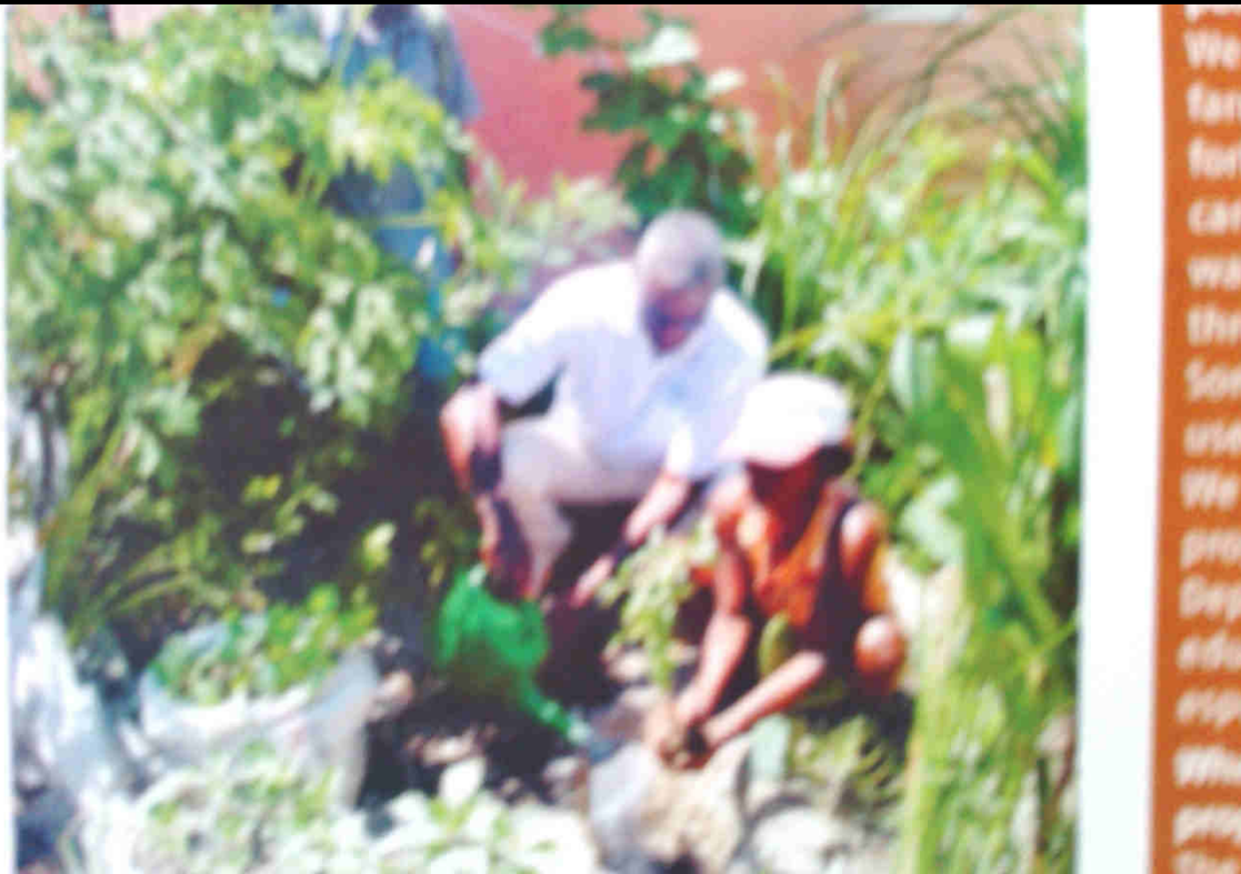
Plate 2: A micro-garden in Haiti