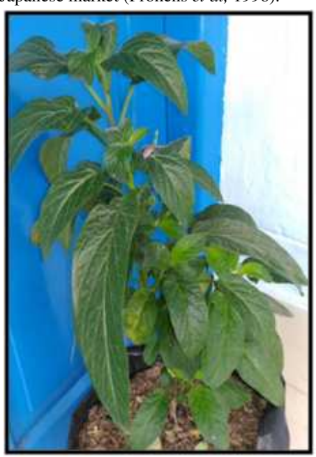
Fig.1:Plant of Pepino

America, Morocco, Spain, Israel and the highlands of Kenya, as the pepino is considered a crop with potential for diversification of horticultural production (Munoz et al, 2014). In the United States the fruit is known to have been grown in San Diego before 1889 and in Santa Barbara by 1897 but now a days, several hundred hectares of the fruit are grown on a small scale in Hawaii and California. The plant is primarily in Chile, New grown Zealand and Western Australia. In Chile, more than 400 hectares are planted in the Longotoma Valley with an increasing proportion of the harvest being exported. Recently, the pepino has been common in markets in Colombia, Ecuador, Bolivia, Peru and Chile and grown commercially in Ecuador, Peru, and Chile, primarily for export to the USA and Europe. Commercial production has also been attempted in New Zealand, with most exports reaching the Japanese market (Prohens et al, 1996).