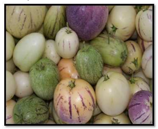
Fig.3: Fruits diversity of Pepino in England

and series Canensa, also with a single species, Solanum canense Rydb.