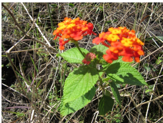
Figure 2. Lantana camara , an exotic plant species with invasiveness potentiality found along tourist trails to Mt. Lamongan