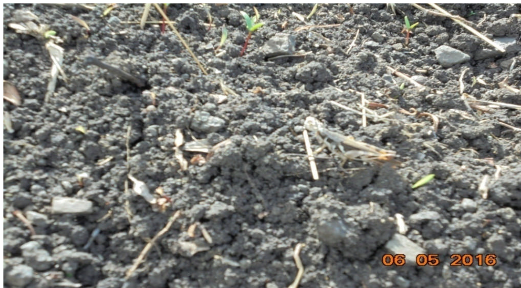
Plate 3. Outbreaks of Locust in the lowlands of the study area.

dry period/Bega). During drought years the surveyed households lack water at least for three months and less than one month during normal years.