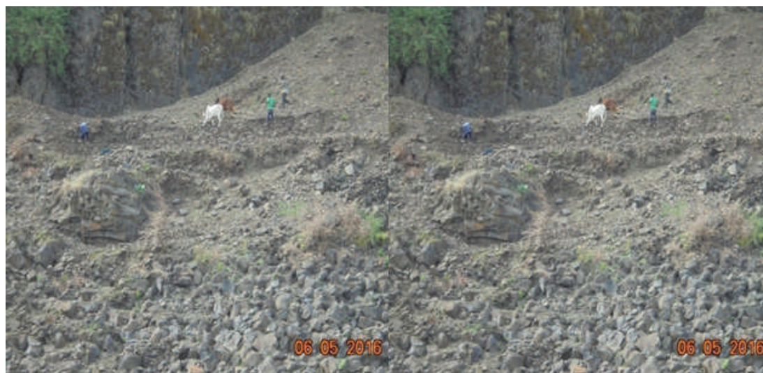
Plate 2. Land slide in the lowlands of the district.

Livestock disease: in the study area climate-induced disease has created health shocks. The seasonal calendar shows that August, September, and October months are high in disease outbreaks, whereas, the month of June and May are low disease occurrence. In the district, animal diseases are; the Black leg, Anthrax, Foot and mouth disease (FMD). Besides, the key constraint to improved livestock productivity remained inadequate feed resources, especially in the dry season. According to the FGDs, when livestock diseases occurred, the threat to the farmers' livestock production is found much severe in all agro-ecology zones of the district. There are a decreasing pasture availability and quality as well as increasing water stress.