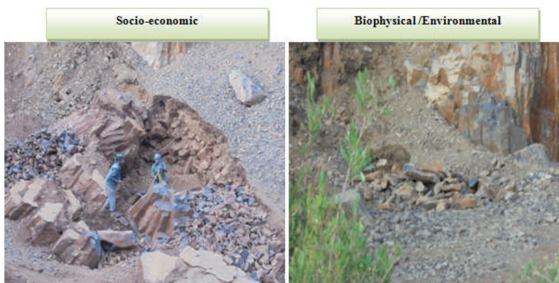
Plate 1. Land degradation due to socio-economic and biophysical influence.

“I do not have to complain about nature rather, my complaint is on the people who changed the natural settings by exploiting the land (Plate1). Before, the mining investors came; there was dense vegetation in our surroundings. After mining investors start, the vegetation becomes bare and the land lacks moisture. Even the malaria outbreaks increased”.