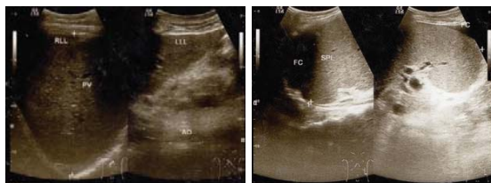
Figure 2. 2 A: Abdominal ultrasound showed hepatomegaly with the size of 15.4 cm, blunted edges, regular surface, coarse heterogenic ecoparenchyma. Dilatation of portal vein was found with diameter of 1.3 cm (Portal vein velocity 9 cm/s); 2 B: Splenomegaly was also found, with diameter of 20 cm, blunted edges, flat surface, homogeny ecoparenchyma and dilated splenic vein (diameter 1.3 cm and splenic vein velocity 16 cm/s).

After gastric lavage was clear for 3 times, patient was given soft, low-salt diet 1700 kcal/day. Patient was also given supportive therapy of intravenous Furosemide 1x20 mg, spironolactone tablet 1x100 mg and propranolol tablet 2x10 mg. In day-2, day-3, and day-4 of hospitalisation, paracentesis of ascites fluid was performed with a total of 9700 mL