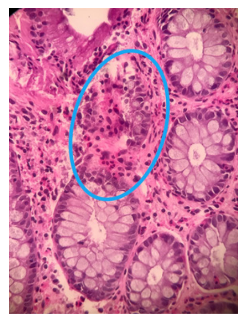
Figure 3. Microscopic appearance of duodenal biopsy (Hematoxylin and Eosin, x 400): common eosinophilic infiltrations in the colon mucosa

There was abnormality found in her abdominal ultrasonography and posterior-anterior lung radiography. Endoscopic examination was performed and showed edematous hyperemic with multiple aphthous lesion and one active deep ulcer. Multiple colon biopsies were then taken (Figure 1). The colon biopsy was reported as EC (Figure 2 and 3). We applied methylprednisolone 24 mg/day. With this treatment, the patient had reduced episodes of diarrhea and had his symptoms improved.