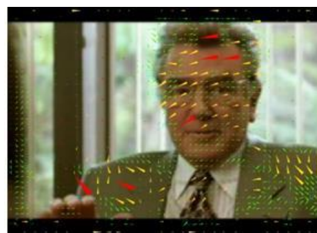
Fig.3: Variable BMA displacement vector

Variable-size block matching algorithms can be distinguished from each other by the technique of multi-resolution and splitting criterion as shown in "Fig.3". Some of the most common methods of variable size block matching procedures include: quad tree approach, polygon approximation [8] and binary partition trees [9]. The quad tree multiresolution approach splits an image frame into four partitions each time based on splitting criteria. In contrast, the polygon approximation approach use content based information of approximate different regions on an image containing polygons.