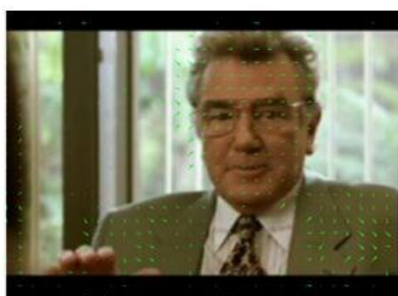
Fig.2: FSBMA displacement vector

In the fixed block matching algorithm, blocks are defined as non overlapping square parts in an image frame as shown in "Fig.2". Each block of the current frame is matched to a block in the next frame specified within a search window [6] [7].