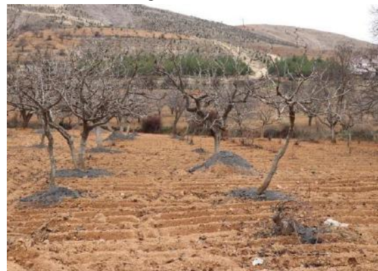
Fig.3: Evaporation and water withdrawn from agricultural land under dry condition in Turkey.

Population increasing, especially farmers in agricultural areas in Turkey, increased industrialization and prosperity that took place in the cities also increases the need for water. Turkey, especially the increase in the major cities in the amount of water used for industrial and residential, which means a reduction in the amount of water used in agriculture and growing population with the greater number of waste water and has led to more water pollution. For this reason, the water used in agricultural areas has to be used more effectively (Anonymus, 2005). The effect of global warming is to extract the water from the small farm ponds used in agriculture and to damage the area as shown in Figure 3.