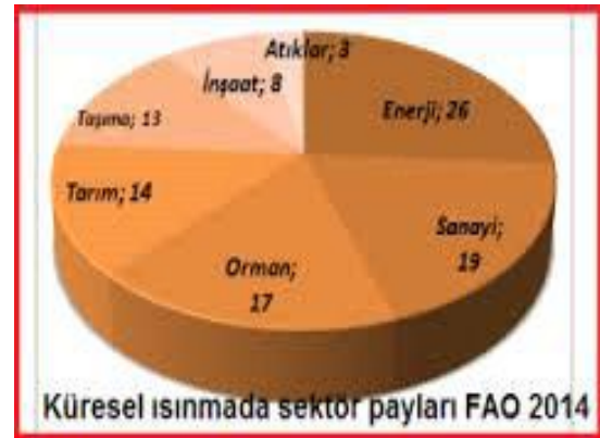
Fig.2: Sector share in global warming in Turkey.

Market share is given that affect global warming in Turkey in Figure 2. Global warming the most affects was the energy sector with 26%. This is followed by industrial forestry and agriculture sectors respectively. Impact of the agricultural sector on global warming was set at 14%.