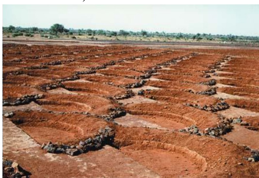
Fig.4: Water harvesting practices for collecting rainwater in arid areas.

and is exposed to the surface of the layer which is in the deep and the amount of humus and organic matter is extremely weak. The deep part is not pushed into the humus wherein the deep drilling down to the groundwater. From this point of view, the deep driving of the fields is wrong. Climate change and the scarcity of rainfall caused limited agricultural production in Turkey. Particularly, in the southeastern region of Anatolia, agricultural production has been hampered by the droughts in 2008 and 2010. The average of 30 years rainfall was 344.1 mm in this semi-arid region. Between 1982 and 2011, the lowest rainfall measured was 227.3 mm in 2008, while the highest rainfall measured was 573.1 mm in 1996. Agricultural production's products are very difficult circumstances under rain-fed conditions (Kuzucu et al. 2016).