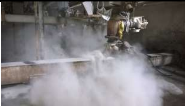
Fig.1: Ash Generation in Thermal Power Plant-Bhusawal

Figure 01 above shows ash produced after combustion of coal in thermal power plant.