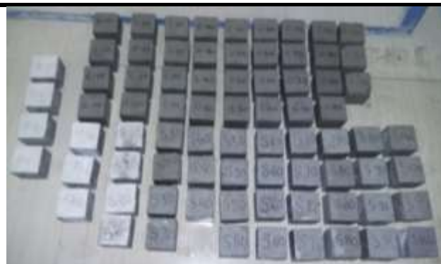
Fig.1: Mortar cubes prepared during experimental work for curing and compressive testing in the

The Experimental work consists of conduction of compressive strength test for all proportions of cement mortar cubes of 7.07 mm x 7.07 mm size shown in figure 01 below. There were two sets of sample series tested (Series-I-Pond Ash Replaced with Sand & Series –II-Pond Ash Replaced with Cement). The result showed considerable gain in the strength when pond ash is replaced with sand up to 40-50 %. Further with increase in percentage the strength goes down. It is observed in Series –II that the gain in strength is limited only up to 10-20 % replacement.