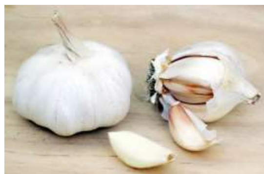
Fig 1: Garlic

Keywords —Peddling unit, transmission unit (gears, etc.), bicycle mechanism, garlic peeler.