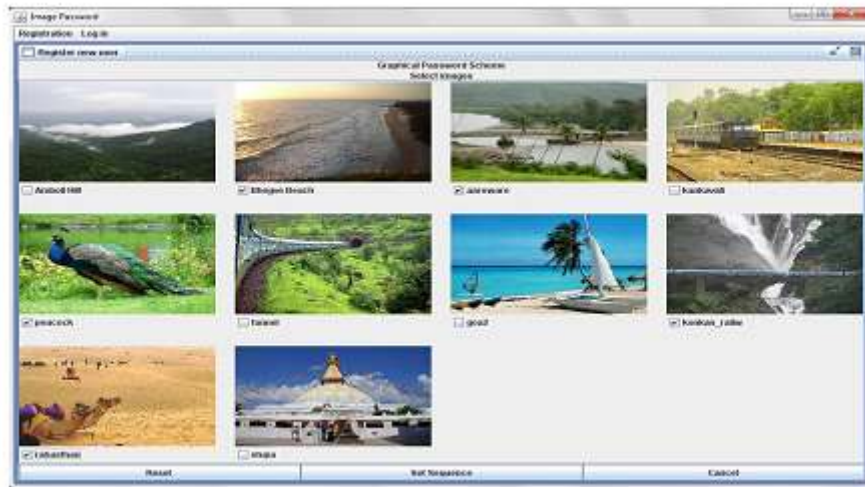
Fig. 4: Image Selection

pool in an order and remember this order of images like a story. Users should further choose k n image from the above selected n images. k is nothing but the single image on which we have to draw secret.