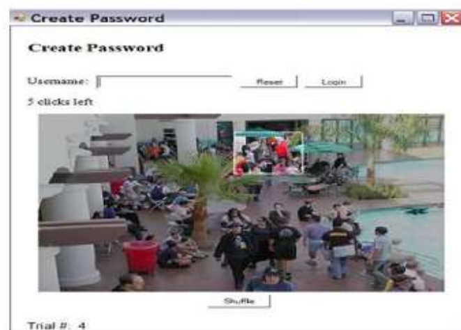
Fig.3: Password Creation in PCCP, Highlighted Area is Viewport

At the time of password creation users may shuffle as often as desired but it slows the process of password creation. Only at the time of password creation, the viewport and shuffle button appears. After the password creation process images displayed normally without the viewport and shuffle button. Then user has to select correct click on particular image. PCCP is a good technology but has security problems. Fig. shows the password creation process including viewport and shuffle button [4].