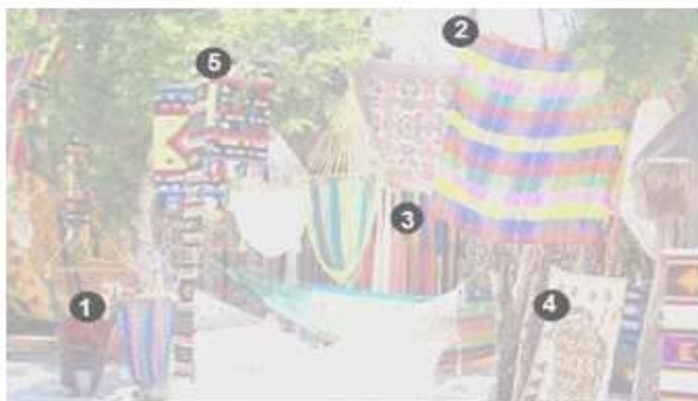
Fig. 1: Pass Point Scheme

the secret code which results pattern formation attacks are easily possible. Thus the pass-point system suffers from these two major disadvantages. To overcome these disadvantages next technique is to be implemented.