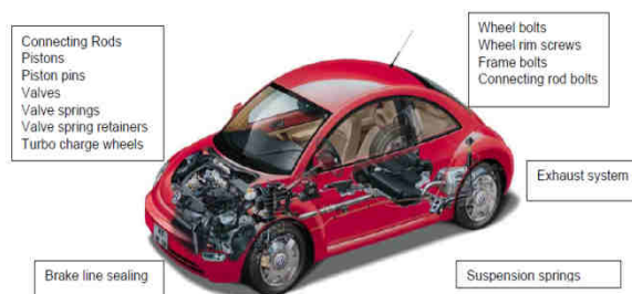
Fig.2: Scope of Ti alloys in automobiles

Although it takes very long for commercialization of Ti in automotive industry, currently Ti has good share of total automobile parts. Following figure shows scope for application of Ti in automotive industry[11].