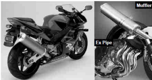
Fig.3: Application of Ti alloy in muffler and exhaust pipe

High class cars and bikes makes use of Ti alloys in exhaust pipe and muffler. In 1988 Kawasaki used Ti alloy in muffler of their sport bike ZX-9R. In similar way Honda CBR-900RR, Suzuki GSX-R1000, Yamaha YZF-R1 used Ti alloys to fabricate their mufflers. By adopting Ti alloys for mufflers approximately 40% weight reduction was achieved[16].