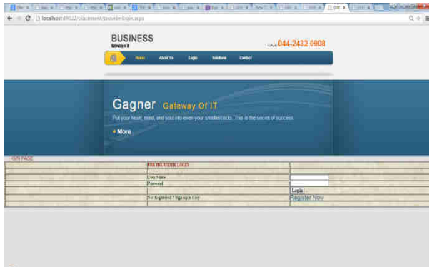
Fig.5.2: Provider Reg.