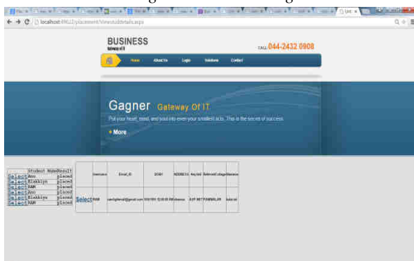
Fig.5.3: View Details