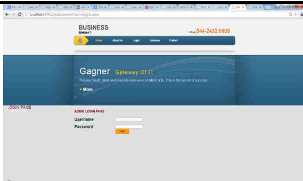
Fig.5.1: Admin Login Page