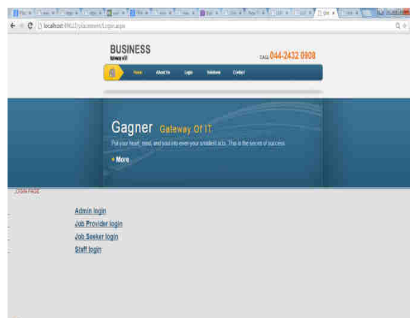
Fig.5: Admin Login