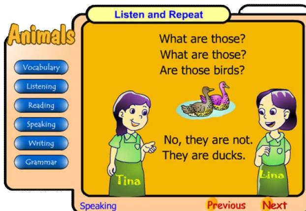
Figure 5. The first page of the Speaking part

Accordingly, the software developed through this study has its design features related to those three levels of multimedia concept. Each level is described below.