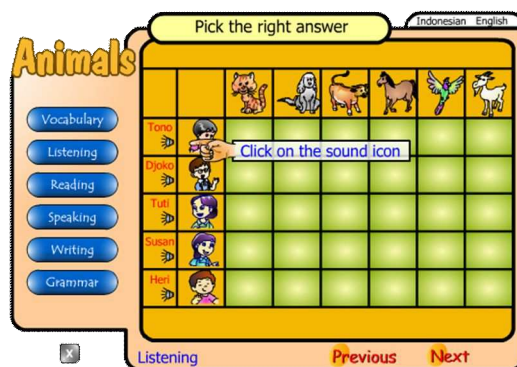
Figure 3. The first page of the Listening part

The six parts of the lesson in this multimedia software are presented in a non-linear mode allowing the students to have a flexible access to the information. In addition, the multimedia software allows interactivity which can be actualized through not only intentional selection of information, but also manipulate and investigate a lesson through active, self-directed exploratory learning (Schnotz, 2001). This can promote cognitive engagement and positively affect learning.