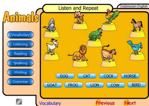
Figure 2. The first page of the Vocabulary part

The instructional content for the theme “Animals” is organized into 6 parts: vocabulary, listening, reading, speaking, writing and grammar (Figure 1). In this lesson, the students are going to learn animal-related words which are presented, first of all, in isolation (specifically in the vocabulary part) and then the words are presented in context (throughout the listening, reading, speaking and writing parts). The language focus is presented in a Grammar part. Basically, each part presents information to learn and an exercise or some exercises to reinforce the students’ understanding of the lesson learned and enhance their language skills. The students’ answers to the exercises are given feedback whether they are true or false. Spoken instructions (in English and Indonesian) are provided in each part of the lesson telling the students what to do.