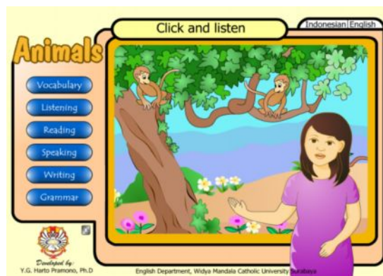
Figure 1. The first page of the interactive multimedia software

achievement through self-learning by which they can practice their English with minimum help from their teachers.