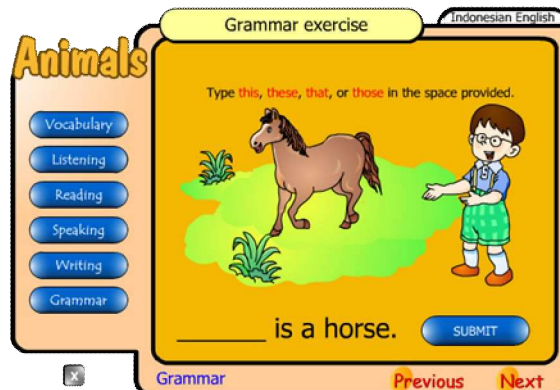
Figure 7. One of the activities in the Grammar part