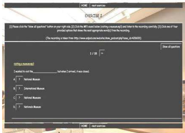
Figure 2 A sample of listening exercise using JQUIZ program