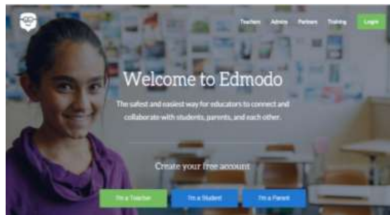
Figure 3 Edmodo home page