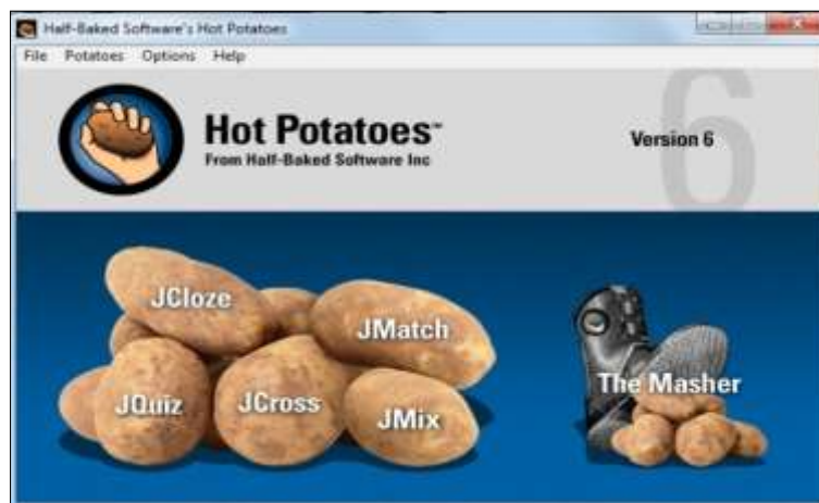
Figure 1 The 6 th version of Hot Potatoes