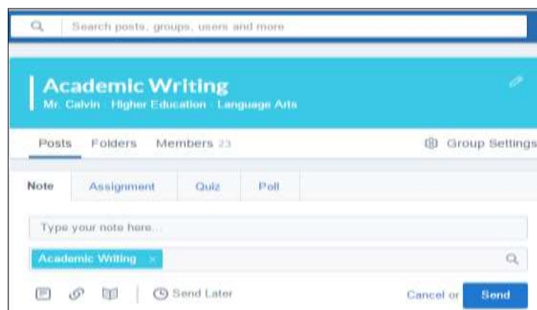
Figure 4 My virtual class in Edmodo