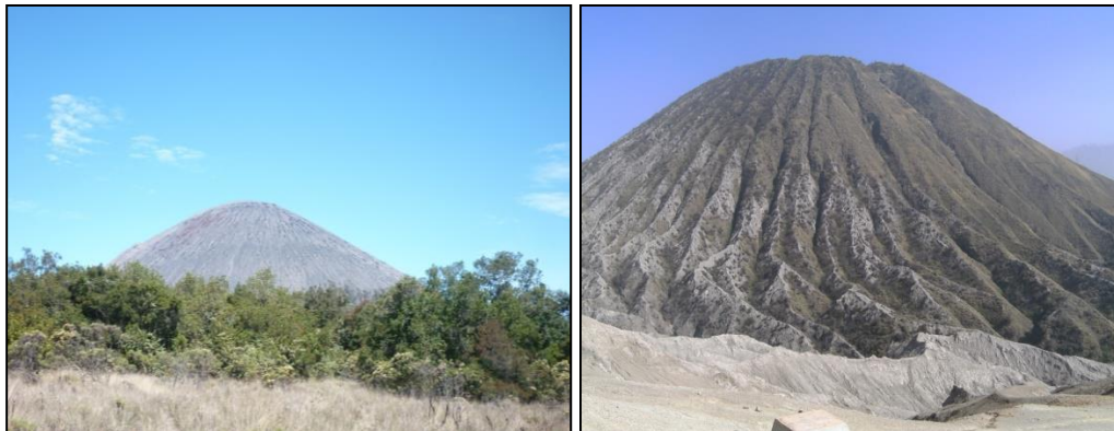
Figure 4. Mount of Semeru (left) and Batok (right)

Mount of Semeru is a mount that is considered the most sacred by the people of Tengger. Mount of Semeru is considered a manifestation of one of Tengger people's as the grandmother of Demak Deningrat. People who are on this mountain are advised to say and behave in a positive and beneficial manner. Negative things should be avoided because it can cause dangerous or bad luck to the person.