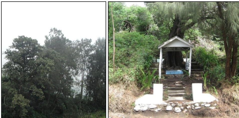
Figure 2. Pedanyangan (left) and Punden Kutungan (right) of Ngadas Village

The form of the pedanyangan usually temple or old tomb, a hidden spring, a collection of large trees such as banyan ( Ficus sp.) or areas that have a special natural landscape. In some places, the pedanyangan also called punden . In the village of Ngadas, pedanyangan has a form of a collection of large trees such as mountain pine ( Casuarina junghuhniana Miq.) and danglu or ki hujan Tree ( Engelhardia spicata Blume.), in which there is a heritage European-style building of Raden Panji Wulung, a figure of antiquity.