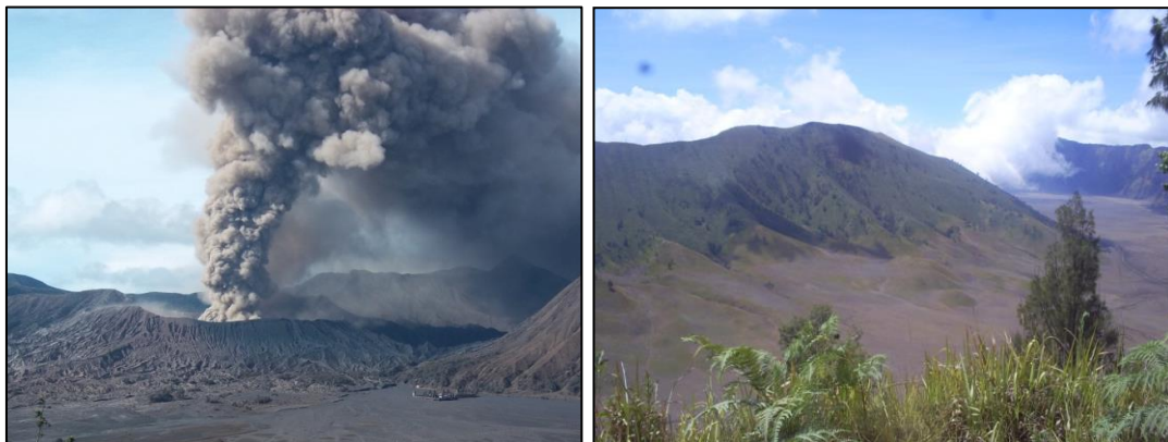
Figure 3. Crater (left) and savanna land (right) of Bromo mount

Historically, the mount of Bromo and other mountains around the Tengger Caldera are formed from the eruption of Mount Tengger. Mount Tengger is estimated to have a height of about 4000 meters above sea level and is considered the largest and highest mountain in its time. As it erupts, the eruption of tengger mountain creates a sea of sand which at that time filled with water. In subsequent developments, emerged several magma streams in the middle of the caldera and formed new mountains such as mount of Bromo, mount of Widodaren, mount of Watangan, mount of Batok (Figure 4) and mount of Kursi.