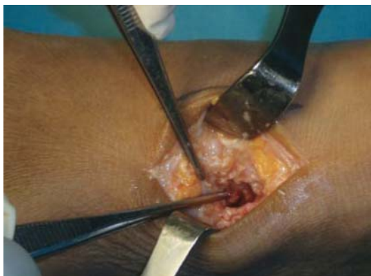
Figure 4 Intraoperative photo showed pus and mass with dimension of 1 x 1 cm.

Surgery was conducted in this case for diagnostic and as well as treatment purposes (figure 4). The result of microscopic examination of pus that was obtained from debridement procedure was positive AFB. The anatomical pathology examination showed non specific chronic osteomyelitis. The patient was given the diagnosis of pulmonary and osteoarticular tuberculosis of the right foot and received the medication of the anti-TB drug of fixed dose combination (INH 300 mg/day, rifampicin 450 mg/day, ethambutol 1,5 g/day, pyrazinamide 1,5 g/day) for two months as the intensive phase. Then the medication will be continued to the maintenance phase for 9 to 12 months based on the clinical and radiographic improvement. After 3 month treatment, the foot swelling and pain are reduced and the range of motion of right ankle joint is improved.