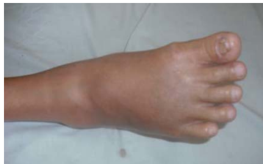
Figure 1 Swelling of the right foot and the right ankle joint

A 60-year-old woman was admitted to Cipto Mangunkusumo Hospital with complaint of chest pain for two days. Chest pain was mainly felt when she inhaled. The pain was accompanied by cough and dyspnea. There were decreasing of appetite with 12 kg weight loss in the last 4 months, intermittent fever, and difficulty to fall asleep. The patient denied having night sweats. She had also complained of swelling and tenderness of the right foot since 2 years ago. There was no history of pulmonary tuberculosis previously. She was a smoker, 12 sticks/day, started from the age of 25 and had stopped when she was 40. On physical examination we found that she was alert with poor nutritional status, blood pressure was 120/80 mmHg, pulse rate was 104 times/minute, respiratory rate was 28 times/minute, and body temperature was 38°C. The conjunctiva was pale. On lung examination, the main respiratory sound was bronchovesicular in both of the lungs with rales in the top and basal of the lung. On extremities examination, the right foot and right ankle appeared swollen and painful upon palpation with limitation of the range of motion of ankle joint (figure 1). The clinical examination of the rest of the systems revealed no abnormality.