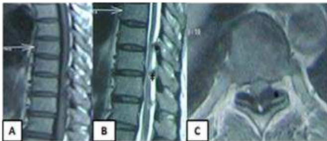
Figure 1 A. T1 weighted MRI of thoracic spine showed continuous OLF between T9–11. B. T2 weighted MRI showed OLF (double dagger). C. Canal stenosis on Axial T2 weighted image due to OLF (asterisk)

A 48-year-old male presented in our spine outpatient clinic complains of weakness of bilateral inferior extremities that gradually worsened over a period of ten years. On admission his muscle weakness 3/5 and hypaesthesia below the dermatome Th 11 was revealed. The reflexes were hyperactive in the lower extremities. Deep tendon reflexes were increased at and below the bilateral quadriceps femoris with myoclonus bilaterally. There was no urinary or bowel dysfunction. Plain x-rays of the thoracic spine failed to demonstrate any specific abnormality.