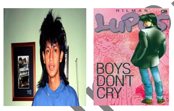
Figure 2 Indonesian Teenage Novel in the 1980's

Lupus' identity is the representation of the author's identity, or more specifically, the author creates Lupus as his own portrait. In social practice, this novel inspires young boys to follow the fashion trends that are promoted by Lupus in the novel (Hilman & Boim, 2013). The fashion trends include one having long hair, chews gum, and folded shirt sleeves, which become a style, whereby teens are attracted to follow in that period. These representations are becoming the discourse because they are living in the teens' daily life in everyday activities. Lupus also inspires the film industry, and again the strong subject of the author is integrated with the literature and film industries in constructing the identity of the young people. The young people (youths) are objects and commodities in the social practice. They are also the followers of trends that are created by the authors and industries, including the chewing gum industry. Hence, Figure 2 shows a picture of the author of Lupus, compares with the front cover of one of his novels (Boys Don't Cry).