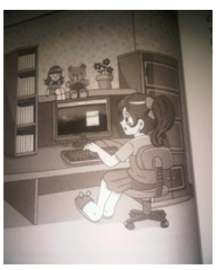
Figure 5 Indonesian Teenage Novels with Modern Technology

One aspect of Figure 5 that uses of technology illustrations shows the prominent use of information technology, which also represents the upper-class teenagers (Livingstone, 2008). This particular novel tells of an English Writing Club that is joined by the teen girl, or in more general terms, of an upper-class family which sends their child to a social activity for upper-class people. This group of students is provided with an expensive brand laptop, which is Apple Macintosh. The illustrator has strengthened the symbolism of social class by drawing a top brandname laptop. All of the subjects involved in the production of this series, including the author, the illustrator, and the publisher have the same perception in the production of meaning. They concur to use teen lit to construct a middle and upper-class social environment through messages and meanings that represented the class of people. The objective is to create distinction, which in this case defines the high status of the teens in the society. This confirms Bourdieu's argument that the high status is a transformation of capital from the financial one into a symbolic one (Bourdieu, 1984).