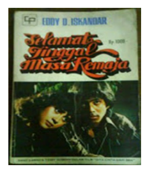
Figure 1 Indonesian Teenager Novels in the 1970's

The subject-object relation in these works of teen literature is based on the author's intent to create a new way to conceptualize literature; literature is not only for adults but also for teens. However, the author (Iskandar) is not alone in trying to narrate teens. Indeed, Eddy D. Iskandar writes teen lit because of the high demand from the film industry, and eventually teen lit becomes the first producer of ideas for the development of film industry in Indonesia. A later edition of Selamat Tinggal Masa Lalu (So Long the Past) that is shown in Figure 1 uses photographs of the actor and actress from the movie on the covers of that work. The novel's author and publisher combine with the film industry, act as subjects, work together, and use different powers to create a narration of teens. The teens' identity is constructed based on the symbiotic mutualism of different interests. Ultimately, most of Eddy D. Iskandar's novels are adapted to film, which only focused on common everyday teens' experiences.