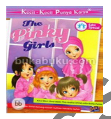
Figure 3 The Indonesian Teenage Pink Color Novels

Five pictures in Figure 3 and the three on the left side have the covers of teen lit written by young writers who are no longer teens, whereas the two on the right side are from the series Kecil-Kecil Punya Karya, written by the teenagers. All of these novels have pink color on their front covers. The titles of the three books on the right use illustrations related to the pink color. Marmut Merah Jambu (Pink Marmot) is written by Raditya Dika (male author), one of the Indonesian best-known young writer that talks about a girl with whom a boy is falling in love. Although Raditya Dika is a male, he uses the color pink to represent a girl. The two other novels that use the word "pink" as part of the title. The books talk about the things that girls like, such as cupcakes, and have the pink color. The title Pinky Girls makes the association between girls and the color pink more explicit and relational.