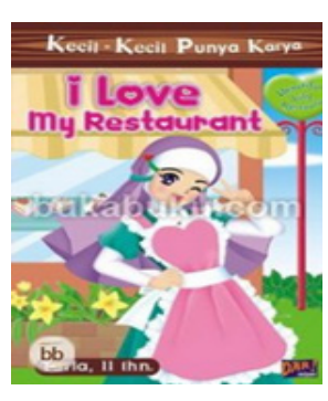
Figure 4 Kecil-Kecil Punya Karya Books

Islam and western symbols are addressed for the girls that are often considered as two different competing poles in social and political practice. It is used at the same time in displaying a story because it cannot be separated from the cooperation of different subjects in the industry of teen lit. Dar Mizan, as the publisher, is a subject that contributes to this construction of narration, while the girls are used to construct this narration. Dar Mizan publisher holds an Islamic ideology with the ideological message, which wants to convey and on the other hand, is a way to attract the target market. Indonesia is the largest Muslim country in the world, and with the rapid economic growth after the Reformasi movement in 1998, the rise of the middle and upper class has been significant (Ansori, 2009). Targeting the Muslim in middle and upper-class readers is the publisher's marketing strategy for financial gain. Indeed, Kecil-Kecil Punya Karya books are quite expensive for the lower-class consumers, and as such, the series' target audience of middle and upperclass children is readily evident.