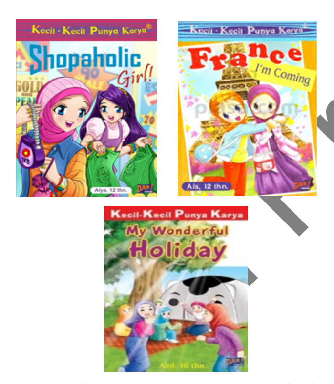
Figure 6 Indonesian Teenage Novels of Modern Lifestyle (www.bukabuku.com)

Indonesian teens are also familiar with the modern lifestyle, where they go for shopping, have holidays, travel to another country, and engage in other activities of the upper-class. These activities are narrated in the novel series. The novels in Figure 6 with titles Shopaholic, France I'm Coming, and My Wonderful Holiday , show how the culture of consumption and its resulting lifestyle have become the teens' goal in Indonesian literature.