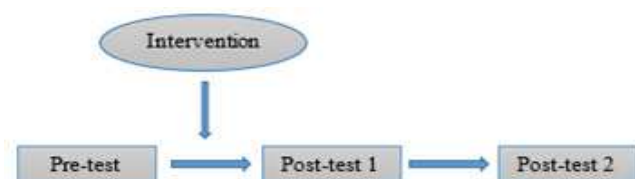
Figure 1 Research Design Framework

The study is conducted on 30 children from 5-6 years age in Kemala Bhayangkari kindergarten, Cikeruh, Bandung. Accidental sampling technique is being used. Figure 1 shows the research design framework.