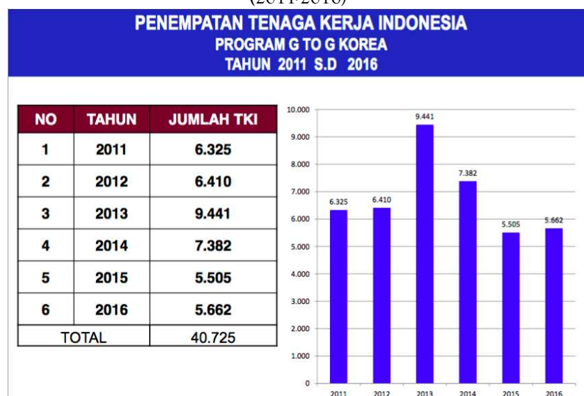
Figure 1. The placement of Indonesian workers in South Korea through G to G programme (2011-2016)

Source: Data Penempatan dan Perlindungan Tenaga Kerja Indonesia Tahun 2016. Pusat Penelitian dan Pengembangan Informasi. Badan Nasional Penempatan dan Perlindungan Tenaga Kerja Indonesia.