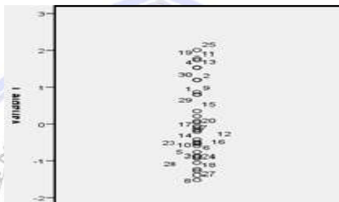
Figure 3. Flattened Subject Weights