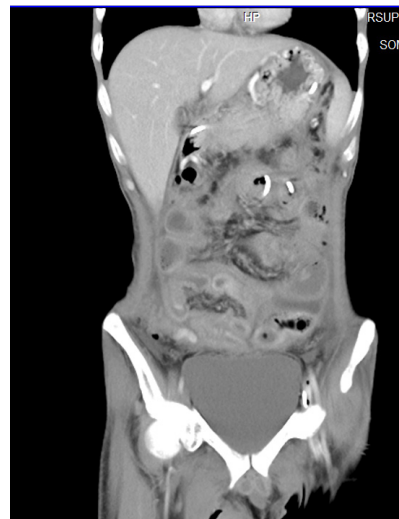
Figure 1. Coronal contrast-enhanced abdominal CT scan from current hospitalization showing thickening of bowel wall, ascites, and thickening of peritoneum

Patient was admitted to our hospital and underwent several examinations. Anterograde double balloon enteroscopy (DBE) revealed erosive gastropathy with gastric mucosal edema and multiple adhesions at the jejunum. Nasojejunal feeding tube (NJFT) and NGT were inserted for nutritional access and decompression, respectively. His repeated abdominal CT scan on the sixth day of current hospitalization showed ascites, thickening of bowel wall and peritoneum without any signs of ileus.