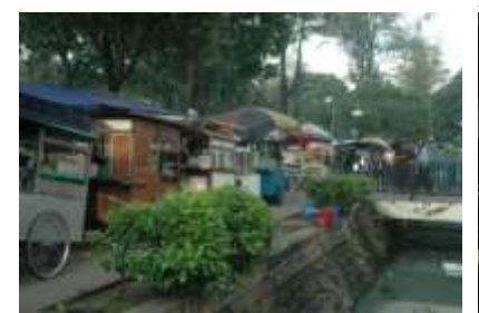
Utilization of tent stalls on the pedestrian track