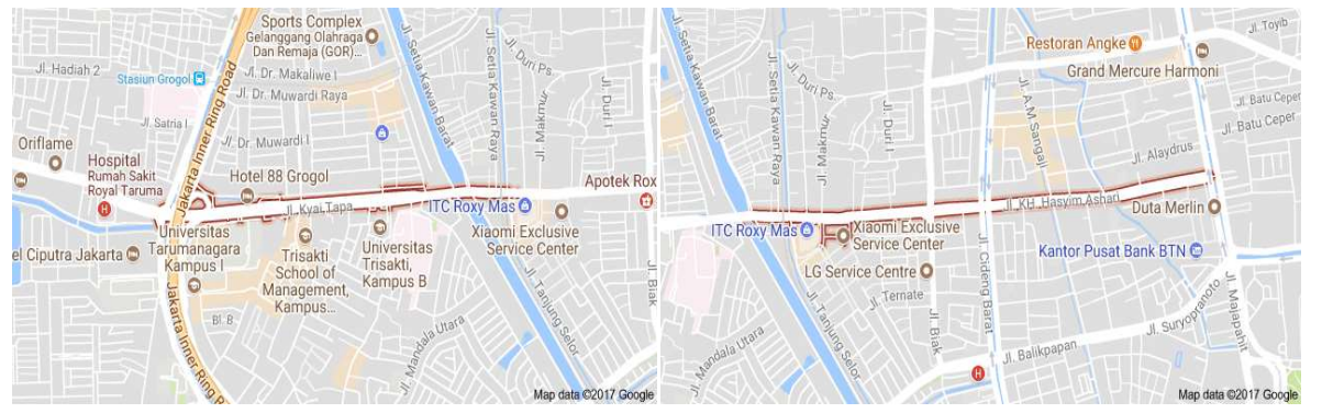
Figure 3: Kiai Tapa - Grogol Street Corridor Area up to Jl. KH. Hasyim Ashari - Roxy, West Jakarta (https://www.google.co.id)

The study area was at Kiai Tapa from Grogol Road Corridor Area up to Jl. KH. Hasyim Ashari - Roxy, West Jakarta (Figure 2). This location was selected as an object of case studies, which is an area of rapid physical development. Appropriation is a mixture of residential land, stores, trade, higher education, hospitals, bus terminals inside and outside the city, and other functions, making the pull factors and driving forces followup activities that continue to grow and expand, causing the function space- Public spaces and pedestrian paths are displaced, leaving their existence neglected.