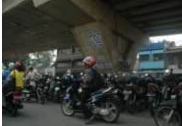
Street Vendors and illegal buildings along Motorcycle parking spaces utilized the curb under a flyover