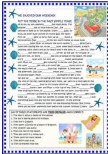
Figure 4. Worksheet 1

The second meeting, the writer reviews the previous material to the students. Then the writer asks the students to analyze some sentences to find out about the pattern of Simple Past Tense. The purpose of this activity is the students can discover the pattern of simple past tense by analyzing some sentences in past tense form. This activity also makes students not focusing on the pattern but focusing on the application of simple past tense. It makes the students easily apply the past tense form in daily activity such as, writing diary, writing about their experience, and daily conversation.