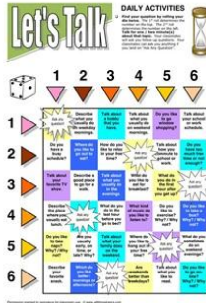
Figure 5. Media for Game

writer also has prepared dice to play this game. The first student will throw the dice twice. The first roll will determine the number on the top and the second roll determines the number on the left. The students have to talk about the topic that they get for a minute. If the students lands on the " Ask any Question", their friend can ask anything. This activity can stimulate the students to speak in the past form.