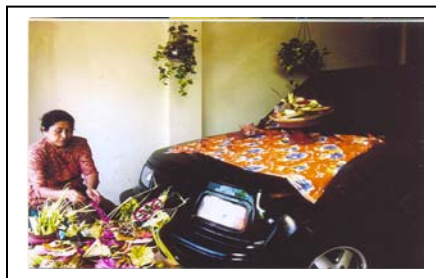
Fig.3 On Tumpek Landep day offering the car