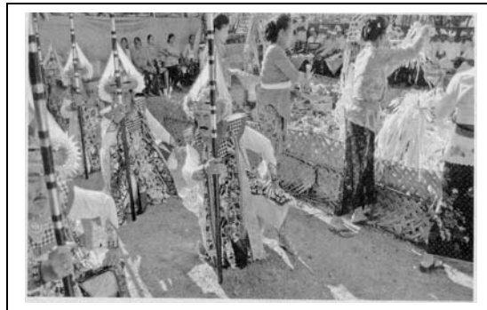
Fig. 5 Offering ( mecaru ) new road at Jalan I.B.Mantra, on August 31, 2005

From many information of accident data from the policemen and connected to the believe of Balinese people there are found as follow: