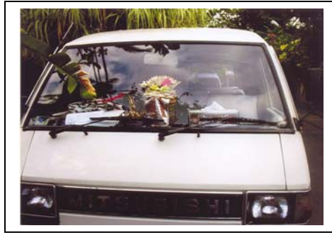
Fig.2 Offer sesajen every day on the car