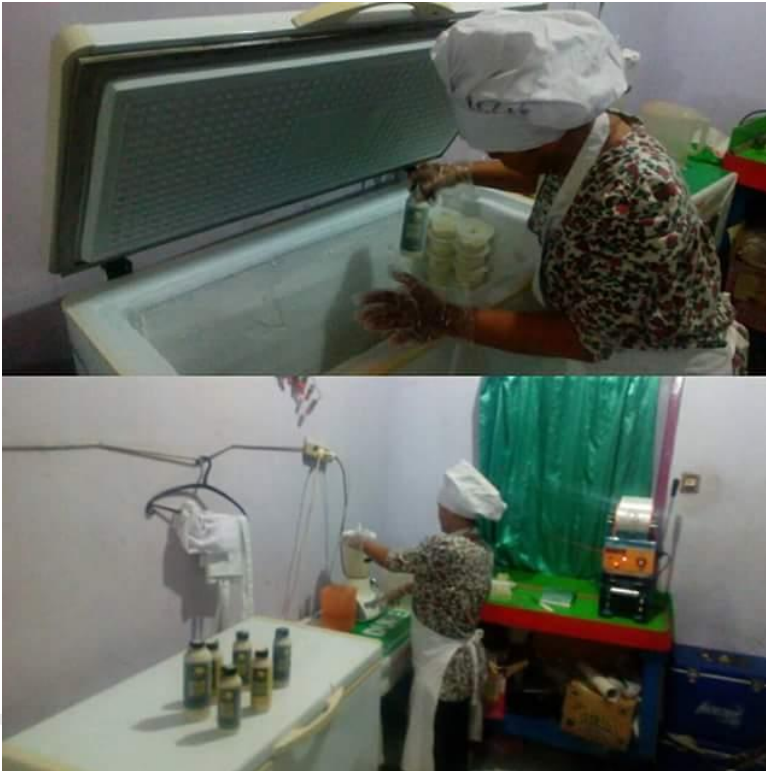
Picture 3 Omah Duren Production Process

The owner also performs sticker printing for packaging bottles. Each week, the owner prints stickers of 21 sheets of A3 sticker paper in the printing press. Out of 21 pieces, it is then divided into 14 sheets for the size of 500 ml, and 7 sheets for the size of 250 ml. After preparing the material, the owner performs the blending process of durian fruit, sugar, milk, drinking water until it becomes durian juice. Blending process is using two blender machines. The finished juice is ready to be inserted into the bottle of various sizes. Then, additional bubble into the Lite bottle before the durian juice is poured. The bottle that already filled with durian juice is closed, then juice left on the edge of the bottle is cleaned. After cleaning process, all the bottles of Udur-Udur are placed into the freezer. Udur-Udur requires special conditions for storage to last long, in example stored in the freezer for two months last. This also causes the owner to buy a freezer as a place of product display in several outlets and centers of SMEs.