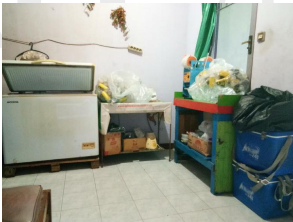
Picture 2 Omah Duren Production Places

After the order is taken, the owner is ready to make the production process. Production process of Udur-Udur starts from the purchase of raw materials to suppliers and to stalls. Raw materials consist of durian fruit meat, milk, sugar, drinking water and bubble. For durian and bubble as raw materials are ordered by the owner from different suppliers, and ordered a few days before the production process, usually ordered on Sunday. Owner buy milk, sugar and water when the stock is began limited at a nearby store. In addition preparing the raw materials, the owner also purchased bottles at a subscription store. Each week, the owner buys about 140 units of 250ml packaging bottle and 104 units of 500ml packaging bottles.