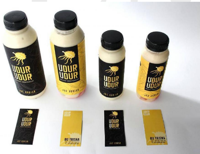
Picture 1 Udur-Udur Omah Duren Surabaya