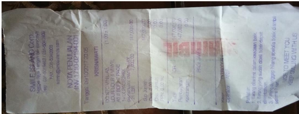
Picture 4 Receipt for Packaging Striker

In addition to raw materials, the purchase of packaging bottles should also get a purchase note, but sometimes the owner did not get it. Receipt evident for merchandise delivery, this evident is obtained from the delivery of merchandise to outlets and day care of SMEs center, because while delivery of goods, Omah Duren does not immediately get cash money.