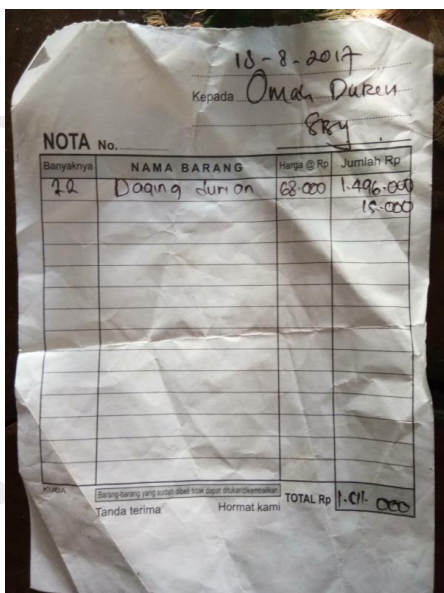
Picture 5 Durian Receipt Notes

In addition to raw materials, the purchase of packaging bottles should also get a purchase note, but sometimes the owner did not get it. Receipt evident for merchandise delivery, this evident is obtained from the delivery of merchandise to outlets and day care of SMEs center, because while delivery of goods, Omah Duren does not immediately get cash money.