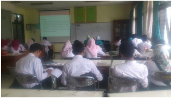
Picture 2 Practicum Activities