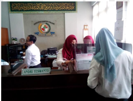
Picture 1 Internships Activities

Internship implementation process in this research is performed at Iqtishod Cooperative - Economic Faculty of Islamic University of Malang in accordance with the schedule that has been determined during the lecture period of Syariah Operational Finance Course. Students are required to make a grouped internship report after they complete the internship. During the internship season, students can learn to become a Teller, a Customer Service, Financing Section, Accounting Section by serving 1,525 saving customers and 900 financing customers and for Students who pass this Course will get a certificate from Iqtishod Cooperative - Economic Faculty of Islamic University of Malang.