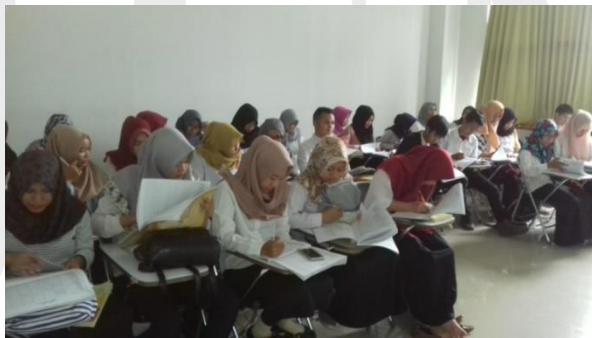
Picture 3 Learning Process