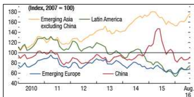
Picture 1 Stock Market Growth