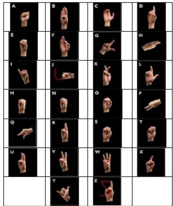
Fig 3 Sample Sign Language Code

using this system, it is able to recognize hand images with different contours by 70%. From the 10 samples of the hand contours used, 3 hands cannot be recognized, while the rest can be recognized.