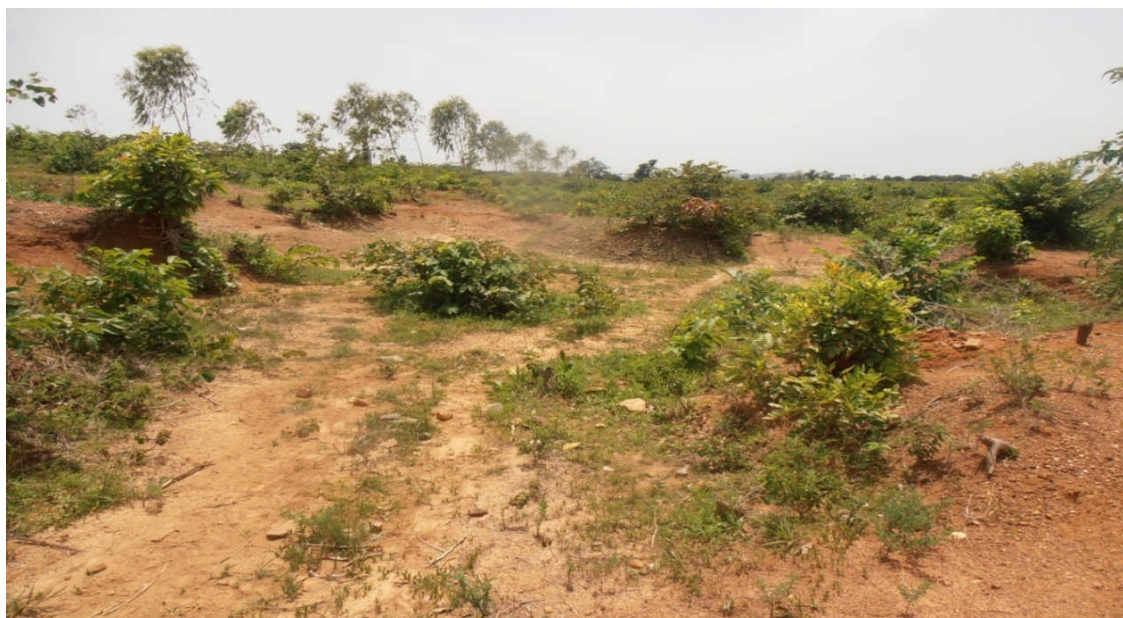
Figure 5. Photograph showing the effect of loss of vegetation on land

checked. Large amount of vegetation has been destroyed and this exposes the soil to erosion and makes it unsuitable for crop production (Figure 5).