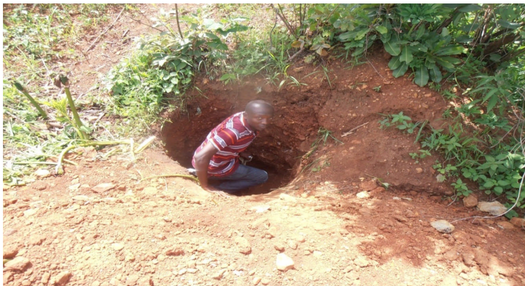
Figure 4. Shows the project student in one of the pit created by the mining activities. This pit may become a potential reservoir for polluted water and dangerous habitat for reptiles such as snakes which can cause harm to man.