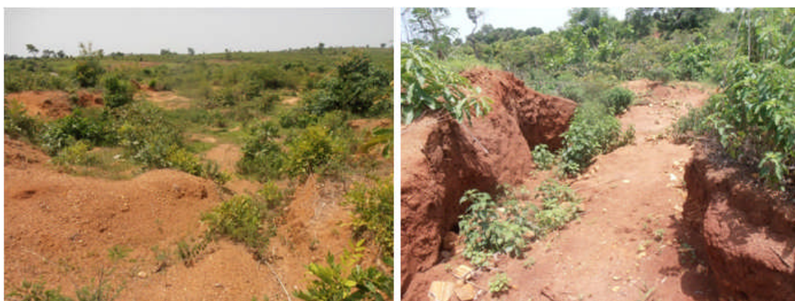
Figure 3. Photographs showing how natural landscape has been destroyed due to artisanal mining in Shango

It was observed during the fieldwork that, the effect of artisanal gold mining in the study area has led to destruction of the natural landscape as result of excavation of soil using shovel and diggers. This will further exposed the soil to erosion as the landcover are removed during such excavations (Figure 3). Thus, reducing farmland. They were observed pockets of pits found in the study area. These pits can be attributed to, or may have been created as a result of the localized artisanal mining activity in the area (Figure 4).