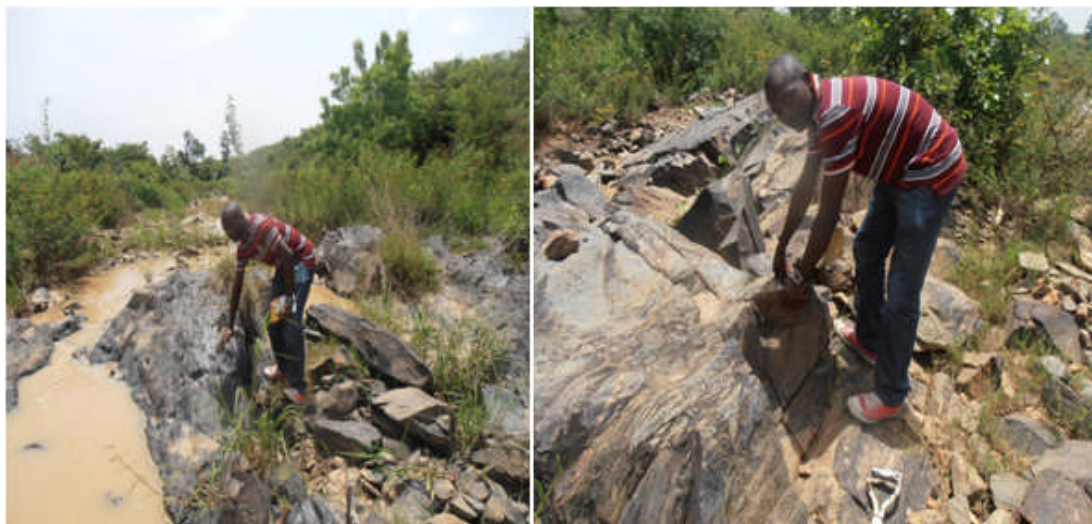
Figure 2. Shows photograph of schist being the dominant rock in the study area. They are generally low-lying, light coloured with characteristic medium to coarse grained texture. Mineral components of the rock consist of quartz, feldspar and mica. The schist is slightly weathered and foliated. The rock generally trend in NW-SE direction and generally dips between 30^{\circ} - 40^{\circ} NW. These rocks are jointed and the joints are filled with quartz vein.

The granites cover about 10% of the study area. They intruded the schist and are light in colour. Texturally, they are coarse grained. Mineral constituent of the rock consist of quartz, feldspar and muscovite. The granites have not been affected by weathering and are slightly jointed.