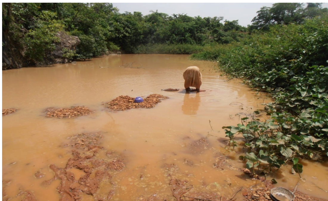
Figure 6. shows a photograph of an artisanal miner panning gold in the Shango River. This has turned the water brown and may further lead to pollution of the water, thus, posing threats to both man and animal health.