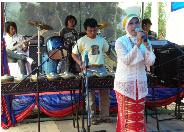
The photo above shows a performance at a wedding celebration in Padangpanjang in 2008.

Talempong goyang uses a number of Western and electronic musical instruments such as guitar, keyboard, and drum set.