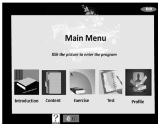
Picture 1. Instructional Multimedia CD