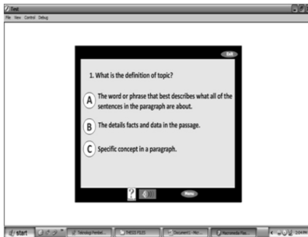
Picture 6. Practice test in instructional multimedia product