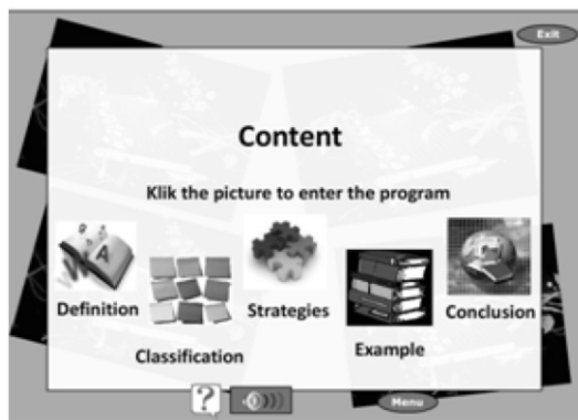
Picture 2. Instructional Multimedia CD