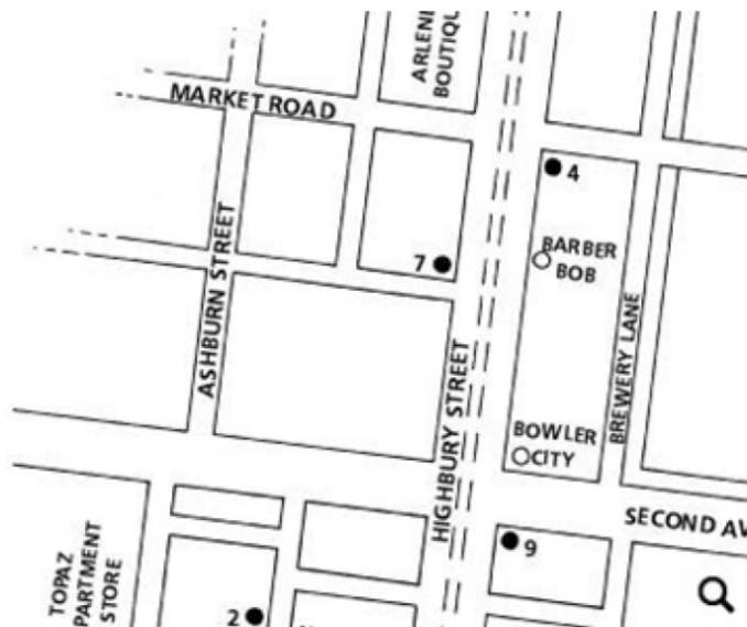
Picture 4 Picture of direction to practice speaking English