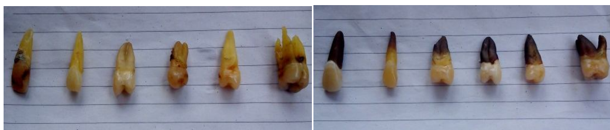
Figure 4. Dental lightness level on group control and treatment after soaked in extract rosella for