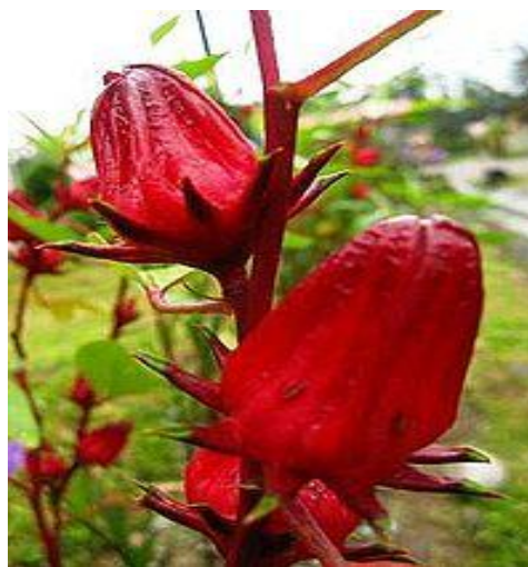
Figure 1. Rosella ( Hibiscussabdariffa )

Rosella ( Hibiscussabdariffa ) containing bioactive compounds, saponins that foam can bind colourants. With a capacity of a substance which can bind the colourants can be used to whiten teeth 2 . In addition, a high vitamin C can help the process allegedly whitening the teeth. Based on the above background, the author is interested in researching the effect of extracts rosella ( Hibiscussabdariffa ) as an alternative to natural teeth bleaching agent on external discoloration case.