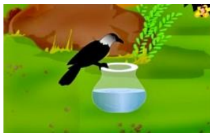
1. (A thirsty crow, a pitcher )