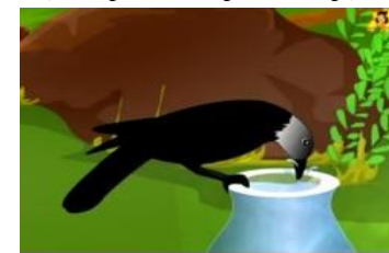
5. (Drank, relieved)