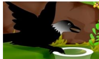
4. (The pebbles, picked up)