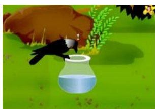
2. (Some water, indeed)