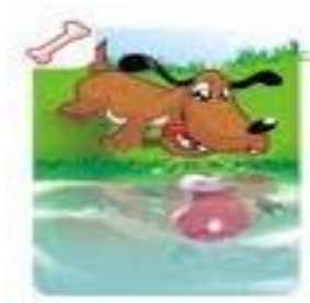
3. (bark, fall)