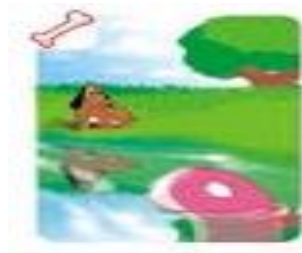
4. (drift, meat)

Orientation: One day a dog walking down by the river with happy because he had just managed to bring food. Food is a piece of meat that looks very fresh.