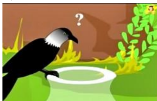
3. (Confused, to reach)