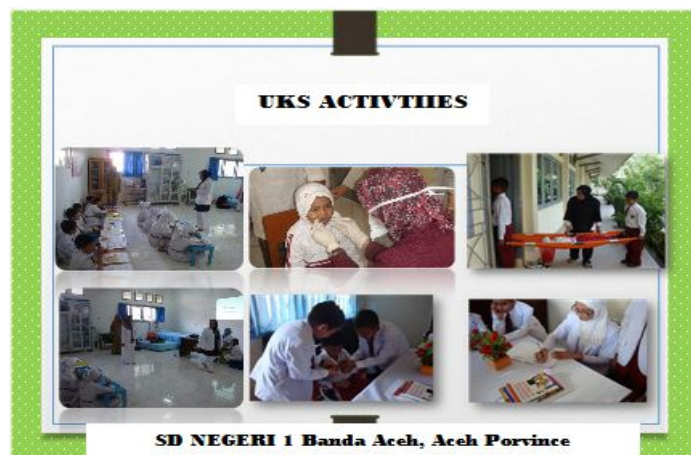
Figure 2. Habituation of Self-Cleanliness