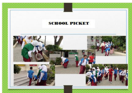
Figure 3. School Picket