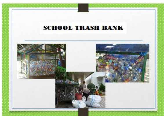
Figure 4. School Trash Bank