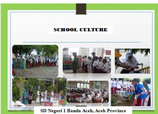
Figure 5. Habituation of School Culture SD Negeri 1 Banda Aceh, Aceh Province