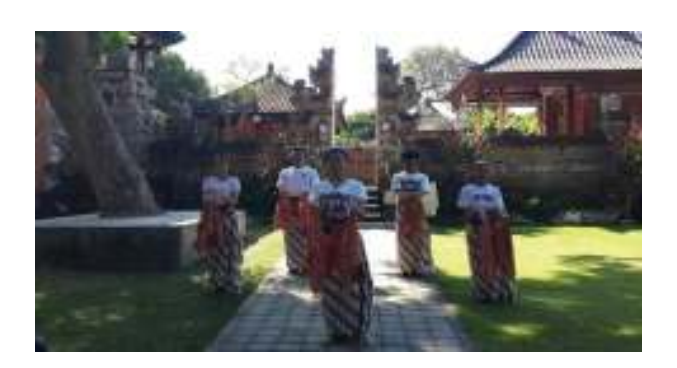
Picture 3. The process of recording The students can explain the basic Javanese dance movements in English

Learning a form of dance, especially classical dance, is actually about a few things that cannot be ignored. This includes several aspects regarding the problem of talent, interest, perseverance, and sincerity. All these aspects are interrelated and very necessary in order to be able to easily master the dance. Given that the technical difficulty of classical Javanese dance is quite high, it is necessary to write clearly about Javanese dance techniques. It is possible to expedite and make it easier for students to learn the techniques of the Javanese dance.