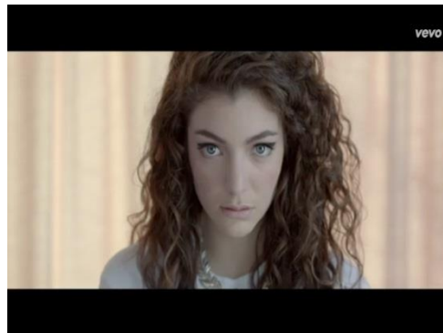
Picture 2. Close-up shot of Lorde

Lorde uses imagery in this song to convey her message. The first line of the song, “I’ve never seen a diamond in the flesh” gives us the image of a person who has never seen diamond in real life. “I cut my teeth on wedding ring” makes us imagine a person who cuts her teeth on wedding ring. Through the line “We count our dollars on the train to the party”, we experience images of people who count their dollars on the train to the party. This also emphasizes the idea of their poverty.