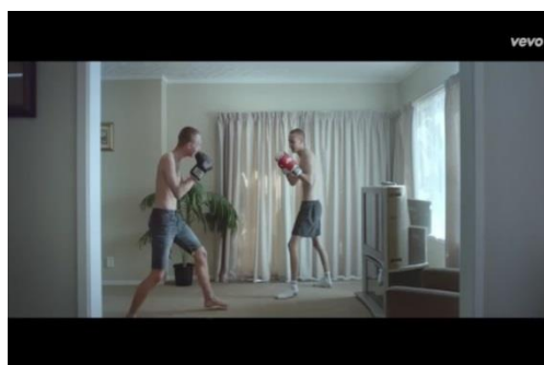
Picture 4. A scene of two boys fighting

The picture above show a medium shot of an empty hall except for the one boy in the centre. The emptiness of the hall suggests that he feels empty and alone inside, or maybe that there is nothing ahead of his future as he looks ahead. In this verse, she mentions “Cadillac, Cristal, Maybach, and diamonds”. Those luxurious and expensive things symbolize the wealth.