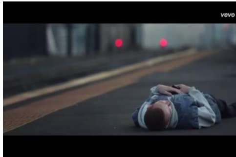
Picture 5. A boy lying beside the train track

can only see a plant, television, and chair. The two boys fighting with each other can be implied that it is something that royals and materialists do, always compete with each other to be the best.