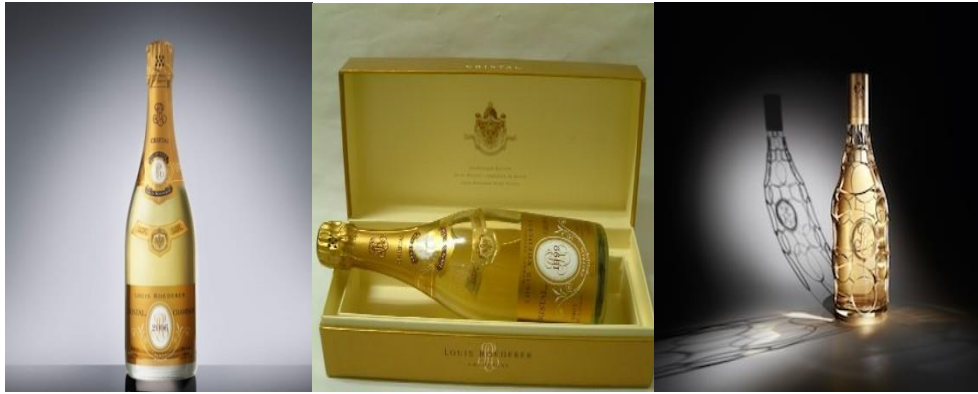
Picture 7. Cristal wines

She mentions on material items that are extremely expensive. The pictures above are examples of the expensive wine Cristal that costs $200 per bottle. It is a wine from South America which has been known for its smooth and sweet taste.