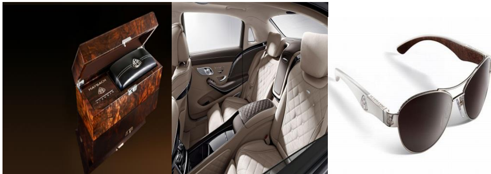
Picture 8. Maybach products

She mentions on material items that are extremely expensive. The pictures above are examples of the expensive wine Cristal that costs $200 per bottle. It is a wine from South America which has been known for its smooth and sweet taste.