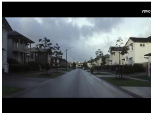
Picture 1. The houses in the music video

The camera shows the scene from a long and landscape shot of the street. The one side of the street is so bright, contrasts with the other side of the street which is darker. This shows the contradiction of two sides of the society, the ordinary or working class of society who live their lives happily and the higher class or the materialists who do not live a happy life because they only focused on material things .