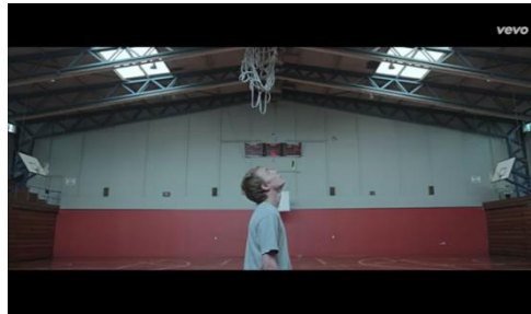
Picture 3. A medium shot of a boy in a sports hall

another line that says “I cut my teeth on wedding rings in the movies”. “To cut your teeth” is a metaphor. To cut your teeth on something means to learn about something. It means that she learns about it in the movies, not in real life.