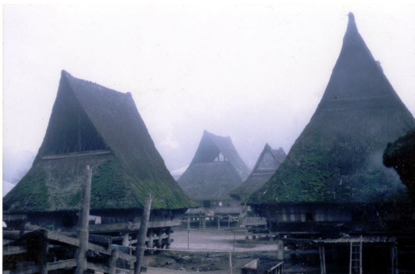
Picture 1. The rumah kuta of Dokan village; Photograph by the author, 1990.

Traditionally, people may only build customary houses ( rumah adat ) within the rumah kuta . A Karo customary house consists of different sections ( jabu ), the number of which may vary from four, six, eight, twelve, sixteen to twenty four. Each of the sections is assigned to a family (also called jabu ) (see Picture 1).