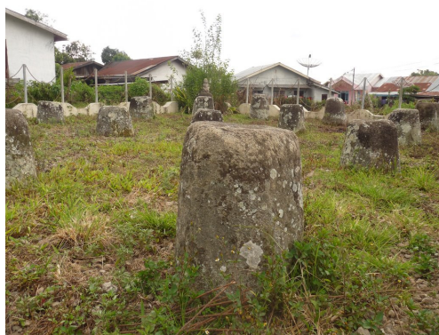
Picture 2. The foundation stones of the house of seven spaces; Photograph by the author.

Neither the myth nor the Karo are able to present information about what the house of seven spaces might have been. In spite of this, most of the Karo know that the foundation stones ( palas ) of the house can still be found in Ajinembah village. The foundation stones stand side by side in an order similar to the foundation stones of the Karo customary houses ( rumah adat ). However, the foundation stones are natural stones and far larger in size than those of the Karo customary houses. One may wonder how the stones could have reached the place, as there is nothing nearby that could have been the source of the stones (see Picture 2 and Figure 3).