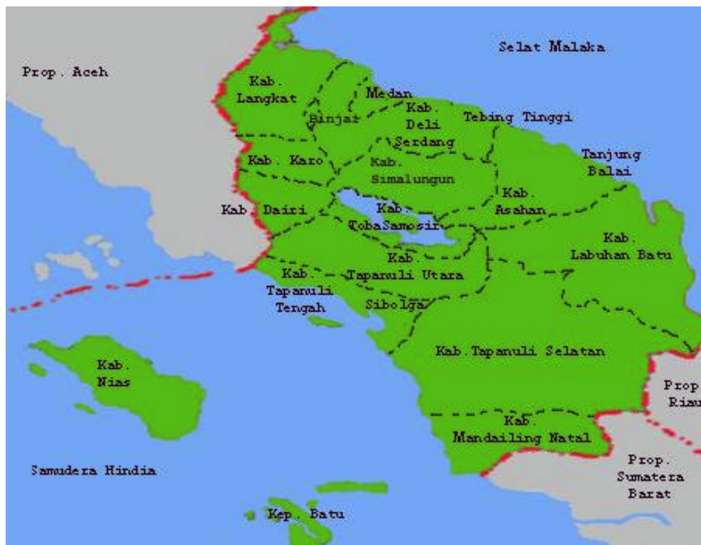
Figure 1. Province North Sumatra.

the upper parts of the Langkat and Deliserdang regencies as well as the upper parts of Medan municipality as Karo Jahe (Downstream Karo) and those parts of Tanah Karo that have become part of the territory of the regencies of Karo, Simalungun and Dairi as Karo Gugung (Karo Highlands).