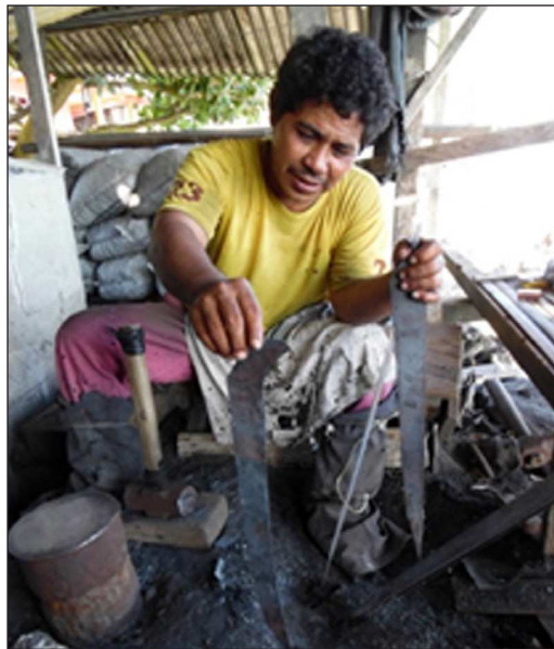
Picture 4. A blacksmith in Popalia was showing a long machete gae-gae (right hand) and common machete (left hand).

Besides machetes, the blacksmiths also produce knives. Their size varies, with a length of 15-25 cm, and a width of 3-4 cm. Their forms look like thin machetes and common (machete) models. Besides being used as choppers in the kitchen, thin knives are considered as heirlooms. Knives are rarely marketed outside Binongko. Therefore, they are produced in a small quantity. Knife sale in Binongko is limited as a souvenir for guests. The knives that are sold have already been sharpened and put in their sheaths.