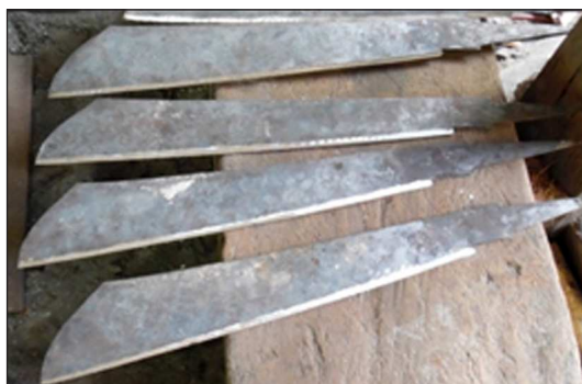
Picture 2. Types of common machetes.

There are four types of machete in various sizes and functions produced by the blacksmiths. First, they are common machetes (Picture 2). They are about 50 cm long, top width 7–8 cm and middle/back width 4–5 cm. These machetes are commonly used to cut small to medium wood. In Maluku, these machetes are much used by coconut farmers. Second, there are big machetes. The top part has the shape of an arc or a curve with a width of 8–9 cm and the middle/back width of 4–5 cm, and 50 cm. Their function is similar to common machetes, but these ones are very good for cutting or carving wood. That is why, they are commonly used by ship makers. Third, there are long machetes (common model and gae-gae , see Picture 3 and 4). 9 The design of long machetes is similar to common machetes (the first type), but it is longer, namely 60–70 cm, with a smaller width than common machetes which are 5–6 cm at the front side and 4–5 cm in the middle-back side. Gae-gae machete's length is almost the same with long machetes, but they differ in terms of their top model, which is curved inside about 5 cm. These machetes are much used by farmers in Maluku to cut grass under and around clove trees. Fourth, there are short machetes (common model and machete). Their length is 20–30 cm. They are much used to cut wood or other small things.