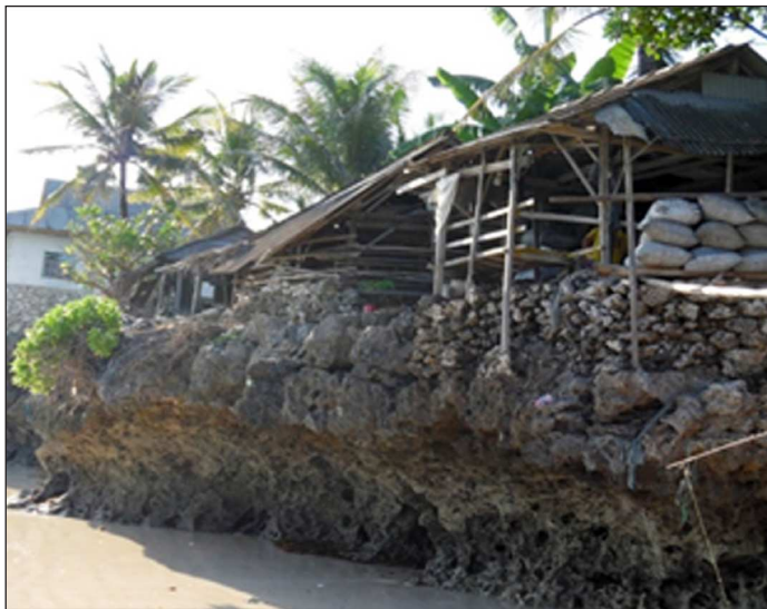
Picture 1. The area of Binongko machete making in Popalia coast.