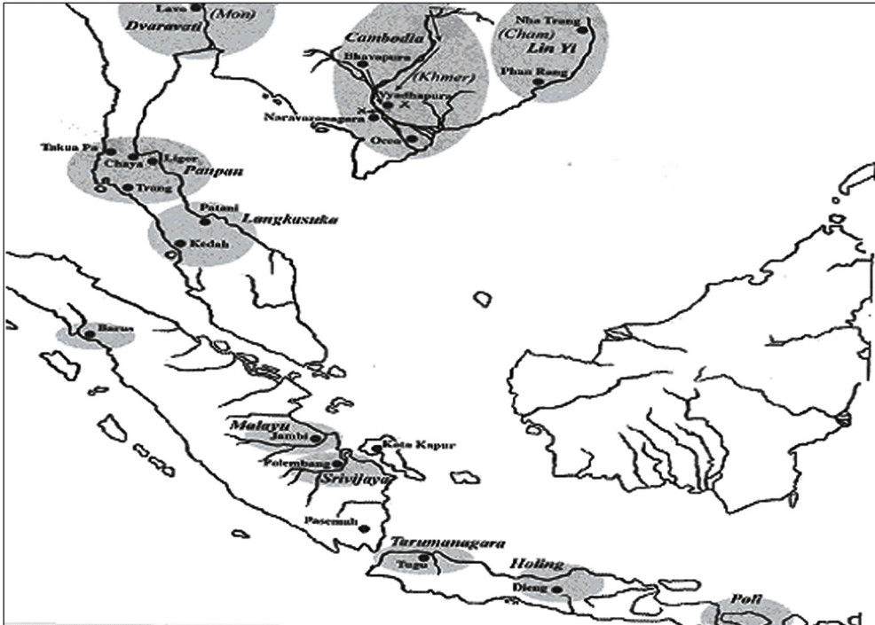
Map 1. Early kingdoms in the Indonesian Archipelago and the Malay Peninsula in the seventh century (Munoz 2006: 111).

On the island of Sumatra and in the Malay Peninsula archeologists have found ruins in Barus, Padang Lawas, Muara Takus, Pagarruyung, Jambi, Palembang,