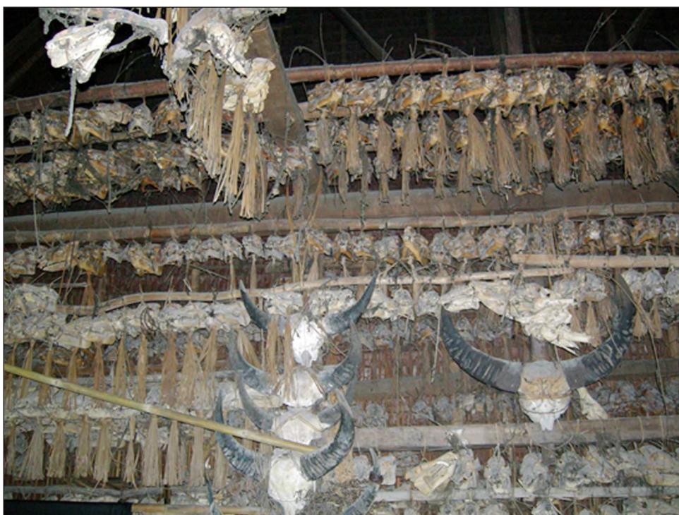
Picture 2. Pig skulls and buffalo horns are kept in the communal house ( uma ) of the Sakuddei kin group in the upriver village of Sagulubbe.

A crew from England making a documentary film and I were in Simatalu in 1998 when a father of a family performed the ritual for his son’s new house. We were allowed to experience the entire process and make a documentary of it (Wawman 1999). We witnessed the father sacrificing four pigs for his son’s new house and for his son’s wife who was pregnant. The father “read” a prediction of good luck, good health and prosperity for his son and the rest of the family when he examined the hearts of the ritually blessed and ritually slaughtered pigs. This sort of augury is not limited to pigs, Mentawaians might also read their fortune by examining the intestines of ritually blessed and ritually slaughtered chickens.