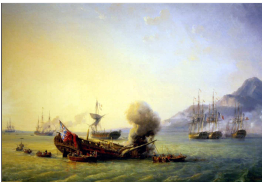
Figure 8. Le Combat du Grand Port, 23 août 1810 ('Battle of Grand Port, 23 August 1810'), Pierre Julien Gilbert, 1842, Musée national de la marine. From (far) left to right: HMS Iphigenia, surrendered to Admiral Hamelin on 28 August; HMS Magicienne being scuttled by fire; (foreground) HMS Sirius being scuttled by fire; (background) HMS Nereide surrenders [24 August]; (right) Duperré's squadron, the French frigates Bellone, Minerve, and Victor.

fitted up for the reception of General De Caen [the French defender of Isle de France], and his suite [...] to set sail on the 16th Dec.[.] General Abercrombie having positively refused to allow De Caen to remain longer on the island.