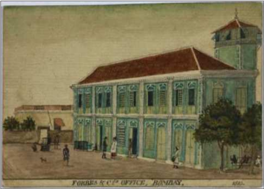
Figure 3. Forbes & Company's office, Bombay. 1810; British Library, BL/WD 315 no.10 [http:// britishlibrary.typepad.co.uk/ untoldlives/ 2013/ 01/ forbes-and-company-one-of-the-oldest-businesses-in-the-world.html].