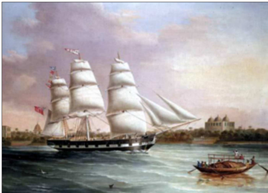
Figure 2. A British country trader, a "full-rigged ship", off Bombay, circa 1850 [ http://www.britannica.com/technology/ship/History-of-ships ].

Colonel Forbes must have thought the ship's name a rather gratifying concurrence – and one wonders if the Bombay trading house of Forbes and Company (Figure 3), established in 1767 by the Scottish peer John Forbes and destined to become "one of the oldest businesses in the world" 4 that still today runs a number of successful enterprises in India, would not have found a vessel bearing their company's tag a carrier suitably appointed for their far-stretched commerce. However, in the ships' registers we could address, we noticed but two mentions of the Forbes : Her only appearance in the annual "List of Vessels belonging to the Port of Calcutta" in the first edition of the East India Register and Directory for 1806 omits the usual entry for a "managing owner" and, speciously by a printing mistake, notes the name of her captain in the line directly above as commander of a Fairlie ; registered under "General No. 95" in Phipps 1840's Collection of Papers Relative to Ship Building in India , the vessel is correctly stated to have been "lost in the Java seas, 11th Sept. 1806", but neither her skipper nor proprietors are revealed (Figure 4).