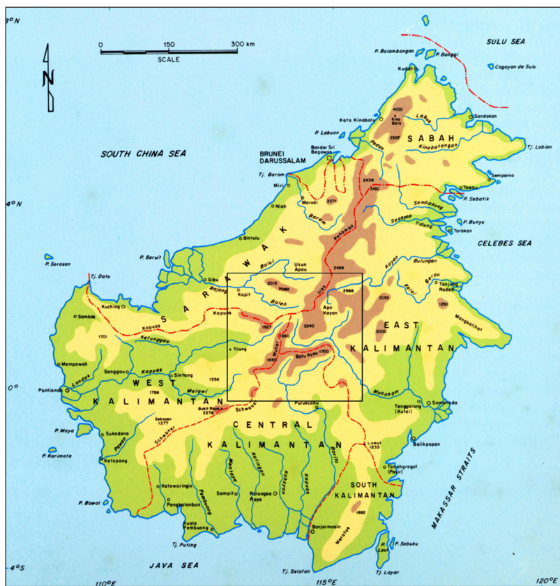
Map 1. The island of Borneo and the area of the Müller and Schwaner mountains.

This paper 2 presents data on a cluster of little-known ethnic groups of one of the most remote regions of interior Borneo, the Müller and northern Schwaner mountain ranges (see Map 1). The data were collected mainly in the period 1975-1985, during which the first writer spent about three years in that area, with additional data gathered in the course of several visits in more recent years. Among other things, historical and linguistic data were collected and were analysed in the early 1980s (for example, Sellato 1982a, 1986).