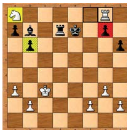
Figure 19. Position on 3rd match after 29. Rg8

Harmonia just wasting a turn by moving it's rook to g8, which supposed to be h8, so that would stop Black king's pursue over the rook.