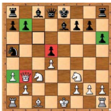
Figure 17. Position on 3rd match after 12. Qb3 Na5

Engine with playbook will most likely playing some particular pattern in the early game, based on the database it has.