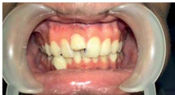
Figure 2 Labially misaligned crown fracture due to mechanical trauma taken from the front side

His medical history was non-contributory. Clinical examinations revealed labially misaligned of maxillary right central incisor. Percussion and palpation test showed no discomfort or pain. There was no mobility noticed. On radiographic examination (Figure 3) showed periapical radiolucency and progressive inflammatory external root resorption on the external apical surface of the root of maxillary right central incisor and open root apex was found. From both the clinical and radiographic examinations, the diagnosis was made as chronic apical periodontitis with apical opening caused by external root resorption