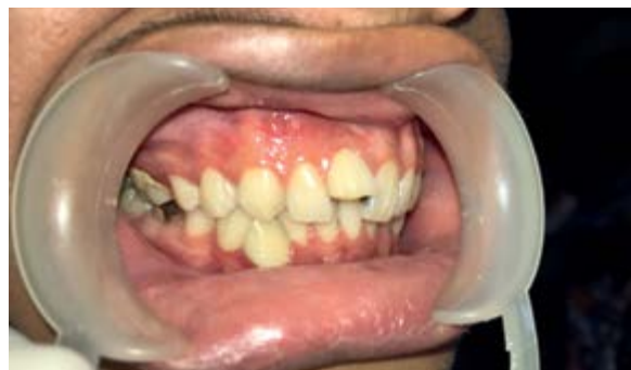
Figure 1 Labially misaligned crown fracture due to mechanical trauma taken from the right side

odontic on RSGM Prof Soedomo, Gadjah Mada University, Yogyakarta, Indonesia for continuing treatment of a traumatic injury of his permanent maxillary right central incisor. The patient's chief complaint was an unaesthetic of labially misaligned fractured crown of maxillary right central incisor caused by traumatic injury 10 years ago (Figure 1 and 2).