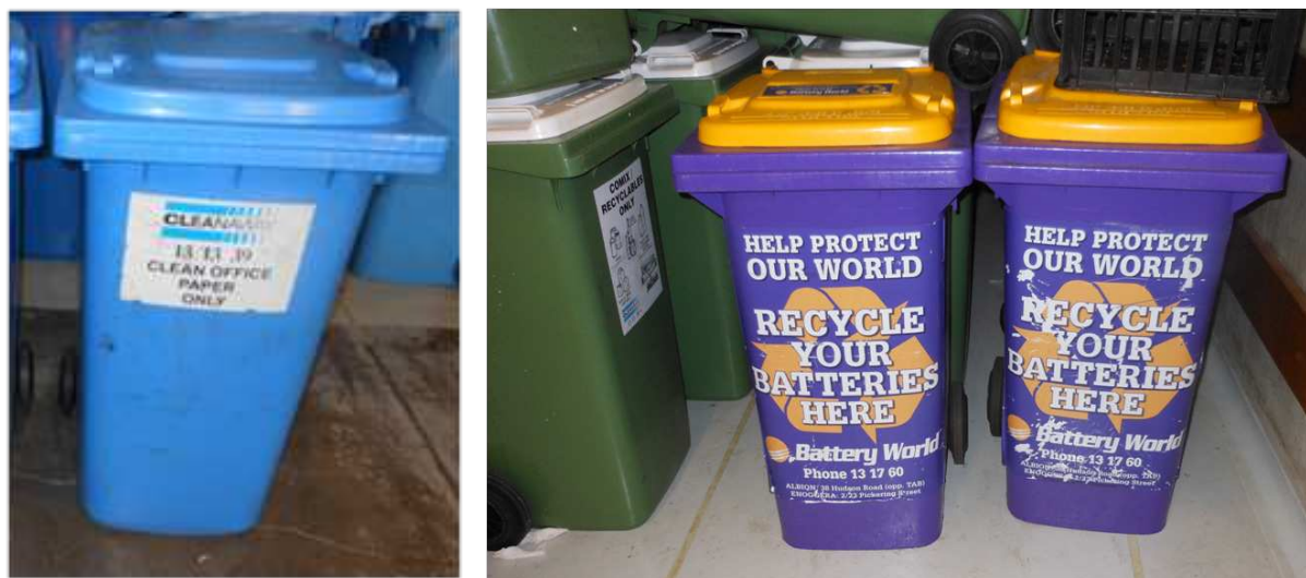
Figure 3. Examples of 3R Application Facilities

In implementing health care systems that accommodate challenges to improve health care services, a supportive leadership is required to