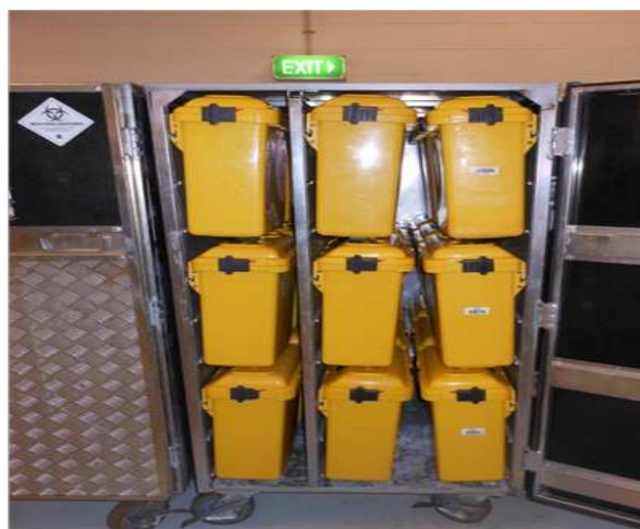
Figure 2. New Model of Sharps Containers

a cell in telophase. Different waste collectors are assigned to replace the full bins in the holding areas with empty bins, and take the full ones to the loading dock in another area, which can be accessed by the assigned contractor staff for off-site bin cleaning, recycling, treatment and disposal.