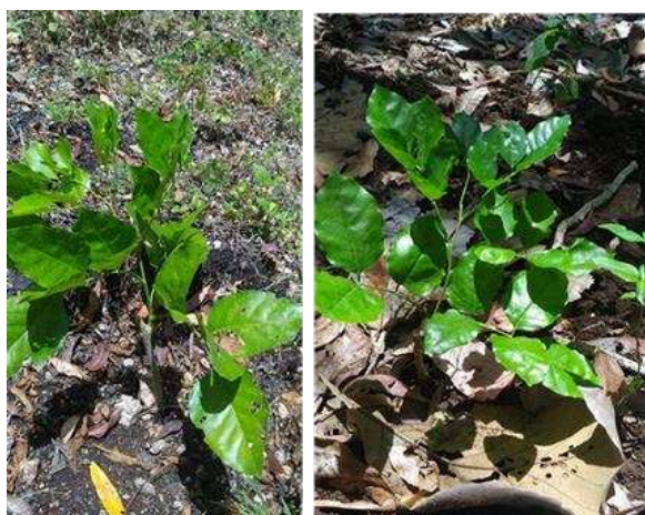
Figure 4. Two months after planting, M. pinnata plants grew well in the field of Bukit Jimbaran, Badung, Bali