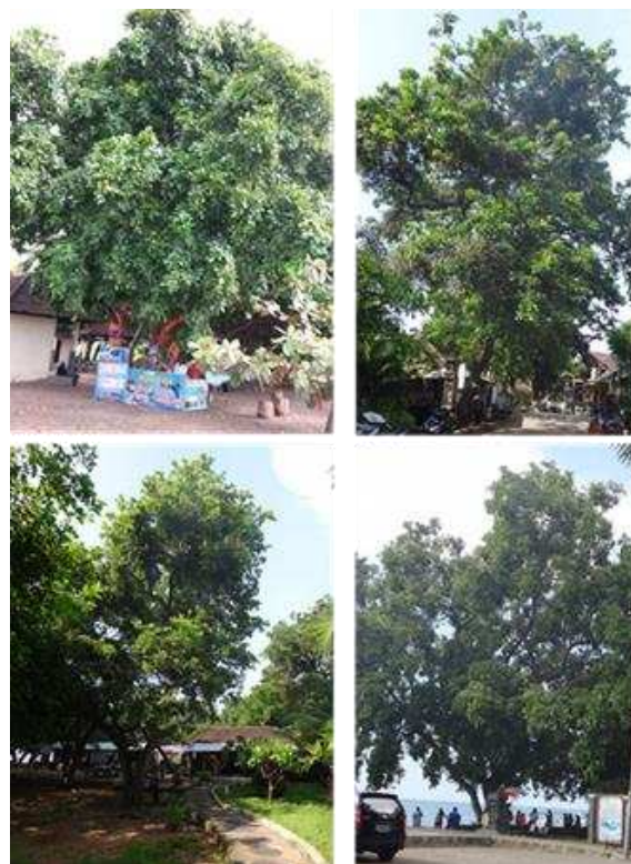
Figure 2. Four selected trees of M. pinnata with high oil content for sources of vegetative propagation

Since the studied trees grow in the similar environment, variation in oil content among trees within location is probably influenced by genotypes according to [9] the influence of environment on oil content is very