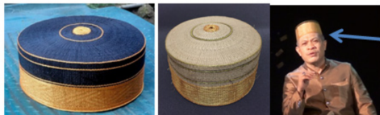
Figure 5. One type of Songkok To Bone used by Petta Puang in "Adong Pulang" (Andi Etal Document, 2016).

In the performance of Petta Puang , the characters always wear songkok wherever or whenever they are as a symbol of descendants of nobility although they wear different motifs on each performance.