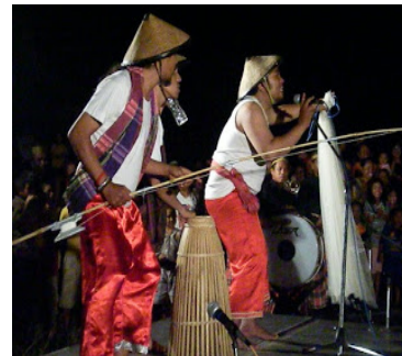
Figure 2. Petta Puang theater group adapting a traditional South Sulawesi theater, “Kondo Buleng” (RSPP Document, 2005)