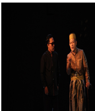
Picture 4. One of brown jas tutup worn by Petta Puang on their performance, combined with songkok to Bone and lipa sabbe (Silk Sarong) to show a very harmonious color combination

The colors used vary like red, yellow, blue, white and so on. In each performance of Petta Puang , Petta Puang's character always wear jas tutup based on the show material, but on another occasion, they wear more dominant brown. Brown color is believed to be the mark of nobility, friendship, and visual sanctity. Some of jas tutup that are used then experience design enrichment because aesthetic factors are now a necessity in a show.