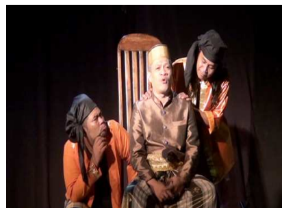
Figure 3. One of the scene in Adong Pulang in the beginning of the show, where the main character of Petta Puang accompanied by Conga’ and Gimpe greeted the audience (Andi Etal document, 2016).

To anticipate that, then they are focusing the exploration only on the distinctive colors of Bugis Makassar culture, especially how the portrait of Makassar Bugis