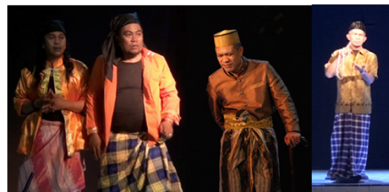
Figure 7. Lipa 'Sa'bbe (Sarung Bugis) with various motifs worn by four characters in the performance of "Adong Pulang". Motif used is in accordance with the status in society (Andi Etal Document, 2016).