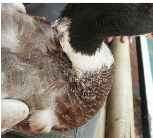
Figure 4. Tongkak color