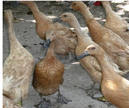
Figure 1. Roman color

The results of observation showed that the feathers of Sasak ducks were in the order of Roman (Figure 1), Rombak (Figure 2), Tanak (Figure 3), Tongkak (Figure 4), and Cemaning (Figure 5). The frequency of each color of the feathers is presented in Table 1.