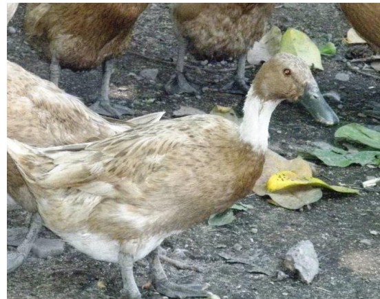
Figure 2. Rombak color